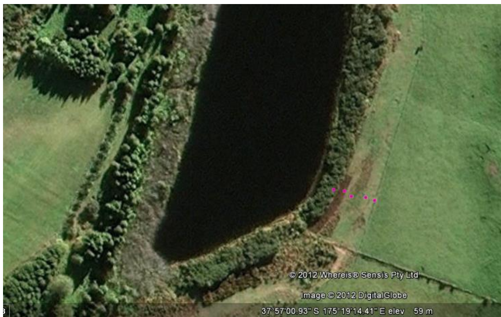
Figure 1 Lake Serpentine plot locations (pink) along wet-dry gradient for testing for hydrophytic vegetation.

The USA methods for determining if vegetation in a plant community is hydrophytic, i.e. the Dominance Test or Ratio or (DT or DR: based on wetland affinity of dominant species) and the Prevalence Index (PI: weighted average that reflects wetland affinity of full species complement) were trialled by workshop participants in plots along a wetland-upland gradient from lake edge to pasture at Lake Serpentine (Fig. 1), south of Hamilton. This incorporates species abundance measures with the wetland indicator status ratings of the species present within plots.