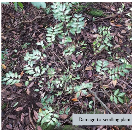
Damage to seedling plant

It is too soon to know what impact the privet lace bug will have in New Zealand. However, significant damage has already been observed on potted plants, and at field sites, suggesting the lace bug could be a highly effective agent in due course. A similar insect, the woolly