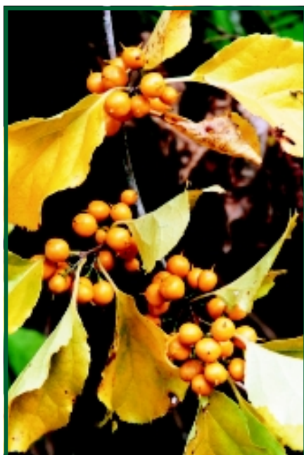
Climbing spindle berry

Climbing spindle berry ( Celastrus orbiculatus ) is a serious threat to native plant communities and forestry plantations. It is highly invasive because of its high reproductive rate, long range dispersal, ability to root sucker and rapid growth rate. Also known as Oriental Bittersweet, Climbing spindle berry is a native to Japan, Korea and northern China. It was first recorded as naturalised in New Zealand in 1981.