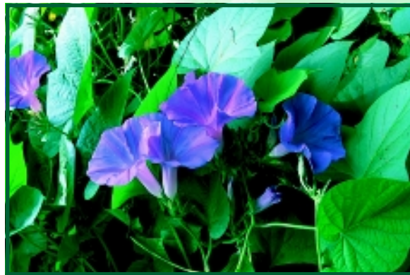
Blue morning glory

Blue morning glory ( Ipomea indica ) is widespread in the tropical Pacific and the Americas. It was introduced as an ornamental in New Zealand and was first recorded as naturalised in 1950. Although attractive, Blue morning glory has a rampant habit and regenerates vigorously from fragments when dumped in waste areas. Plants have occasionally been found to produce viable seed.