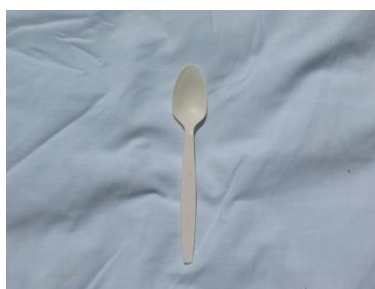
Spoon to apply peanut butter