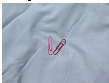
Paperclips x 2