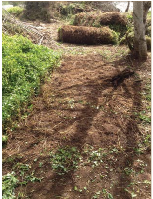
Rolling up the wandering willy as a non-chemical control technique – it took ages!