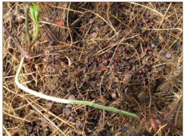
Yellow flag iris seeds.