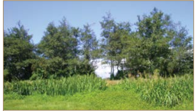
A view to the west across the larger island showing the range of plants (mostly exotic) on the islands.

In the case of the Maurea Islands, these were part of an important marsh wetland area in this part of the lower river providing potential habitat for kaaeo (freshwater mussels), long and shortfin tuna (freshwater eels),