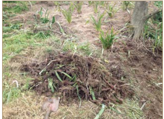
Yellow flag iris rhizomes uncovered after removing reed sweetgrass.