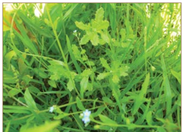
Waatakirihi/watercress amongst the grasses on the big island.