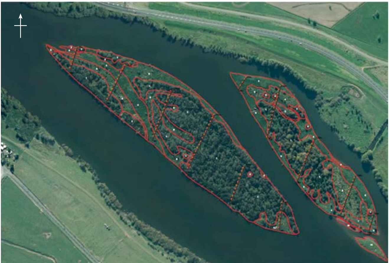
Figure 2. Maurea and Eastern Island. Marks out key vegetation types and lines and orange dots show the transects and plots used in the surveying