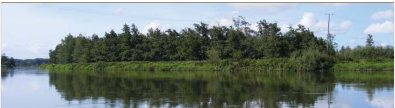
Maurea Islands.

Too often we focus on the feel-good projects – the ones that ticked all the boxes and did everything right. Sometimes though, it is just as important to hear about the ones that didn't quite go the way that was expected or hoped, so that others can learn from these experiences. But, most important, so that those of us involved in the project also remember and continue to learn from it. So, this is our story about the ambitious project on the Maurea Islands – the ups and downs and in-betweens, but most important, the learnings.