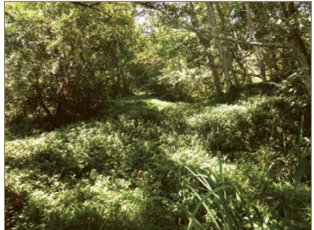
A carpet of the serious forest invasive, wandering willy, covers the higher areas of the bigger island.