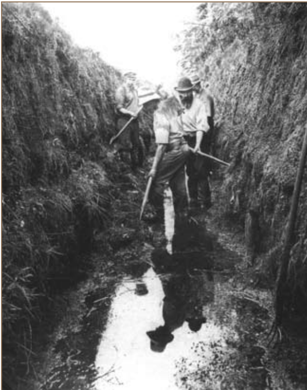
Extensive networks of drains were hand dug in the Waikato, turning swampland into productive pastures.