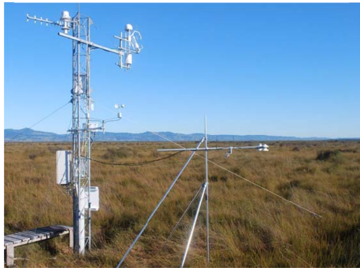
Kopuatai research site

New MSc student, Alex Keyte-Beattie, has started her research at Kopuatai, on the role of the E. robustum canopy in the ecohydrology and CO 2 exchange of the bog. The E. robustum canopy is globally unusual for the large amount of standing dead litter, and its longevity. Alex will quantify the spatial variability of the canopy structure and density, its water balance and impact on evaporation rates and CO 2 exchange. This study will generate new knowledge about ecosystem functioning of E. robustum and its critical role as the primary peat-former.