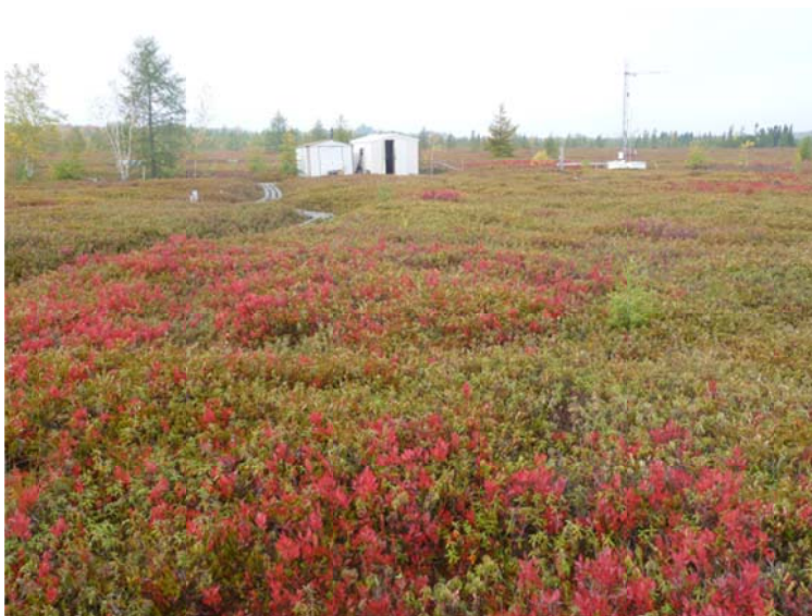
Autumn colours at Mer Bleue