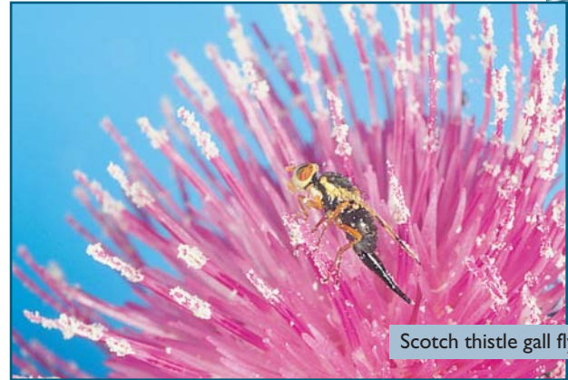
Scotch thistle gall fly

The flies emerge in late spring and you may see them resting on thistles throughout the summer. The adults have dark bodies, distinctive black stripes on the wings, and are about 4–8 mm long. They are almost identical to nodding thistle gall flies (see Nodding thistle gall fly ) both in terms of biology and appearance, but the markings on the wings are subtly different. You may in particular notice the male flies as they set up territories on bolting Scotch thistles and attract females by displaying their wings. You will not be able to see the eggs, as the females