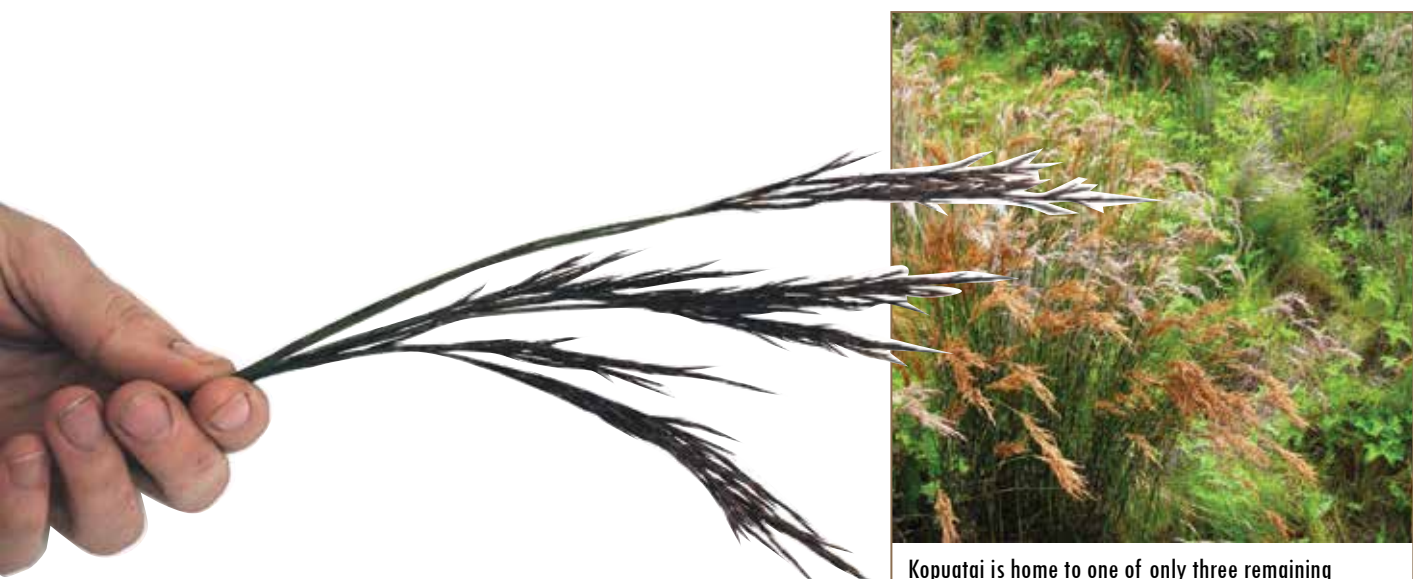
Kopuatai is home to one of only three remaining naturally occurring populations of the restiad, giant cane rush ( Sporadanthus ferrugineus ). The dome is recognised for its international significance under the Ramsar agreement on account of its size, intactness and representativeness.

The wetland types described over the next pages are based on Johnson and Gerbeaux (2004), though in keeping with the freshwater focus of this Handbook, saline wetlands have not been included.