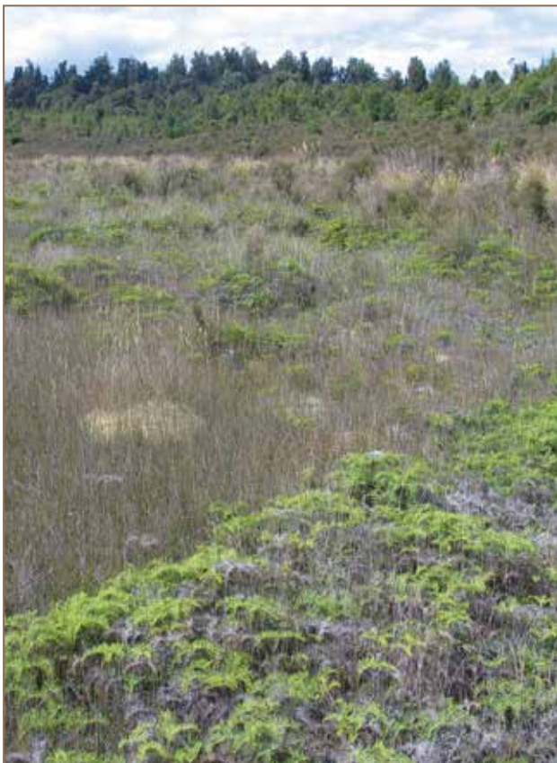
Waiapa mire (Pureora Forest Park, Waikato) is showing signs of recovery from browsing as deer populations decrease through ongoing control.