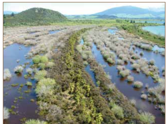
Bands of willow colonising former shorelines are clearly visible at the Waimarino wetland, Lake Taupo.