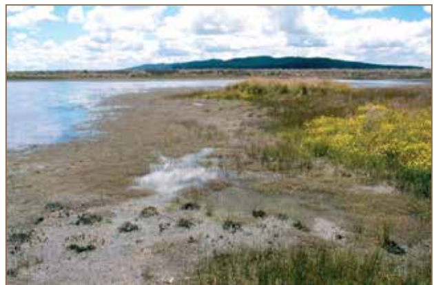
The upper Rangataiki catchment (Taupo), is an ephemeral wetland depression still partly ponded in summer.