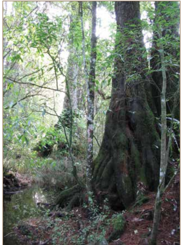
An ecologically important remnant of kahikatea swamp forest ( Dacrycarpus dacrydioides ) forest in the southwest corner of the Kōpuatai peat dome, Waikato.