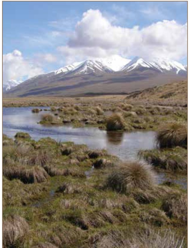
Carex secta and red tussock swamp/fen upstream of Lake Clearwater (Canterbury), part of the Department of Conservation Arawai Kakariki wetland restoration programme.