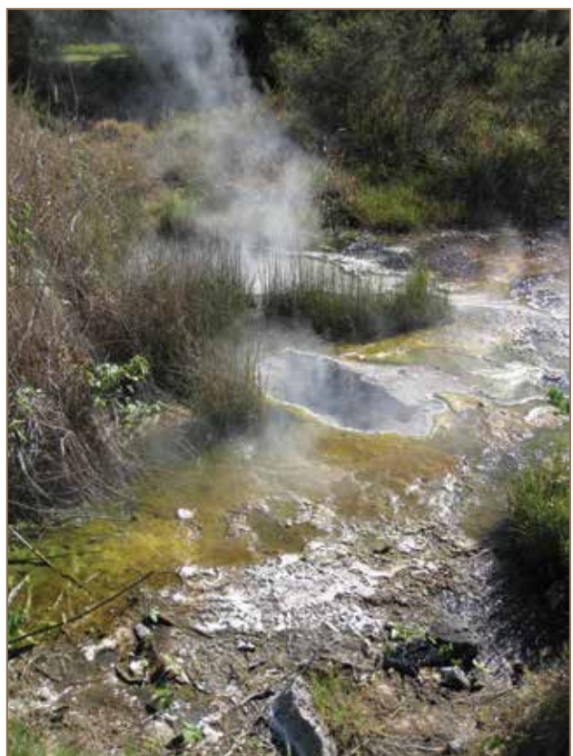
One of the many geothermal wetlands situated in urban Rotorua, Bay of Plenty.