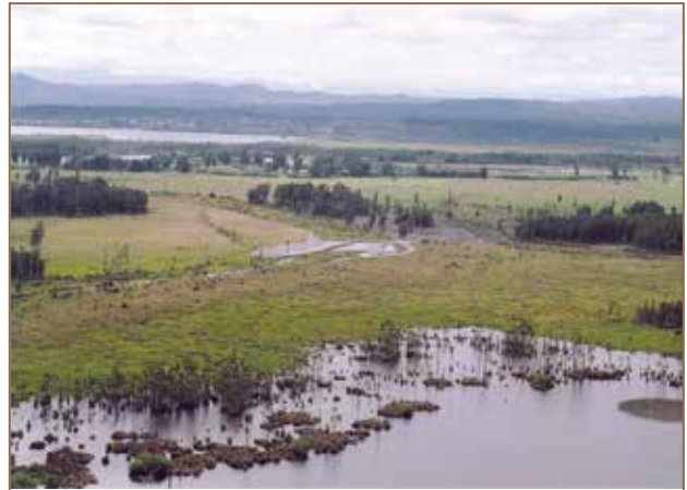
Iveagh Bay, Buller District. Marsh at high water level.

Marsh area on the margins of the Ramsar listed Whangamarino wetland, Waikato.