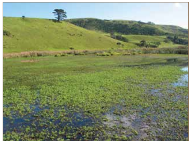
Parrot's feather infests this area of shallow water at Te Henga wetland on the west coast of Auckland.