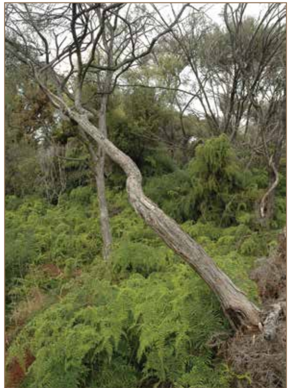
Tangle fern ( Gleichenia dicarpa) and manuka on the shores of Lake Maratoto, one of more than 30 peat lakes in the Waikato region.

Awarua Bog, a Ramsar listed site administered by the Department of Conservation, hosts a range of plants more commonly associated with alpine regions. Southland.