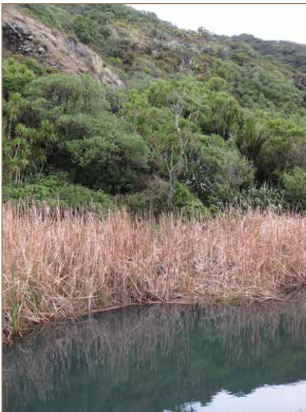
Raupo in winter dieback colonising the swampy margins of a dune lake. Whatipu, Auckland.

Tree, scrub, tall herb, flax, reed, rush and sedge types. Often heavily invaded by willow.