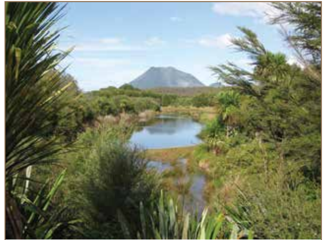
Shallow water area within the extensive Norske Skog wetland restoration site, Bay of Plenty.