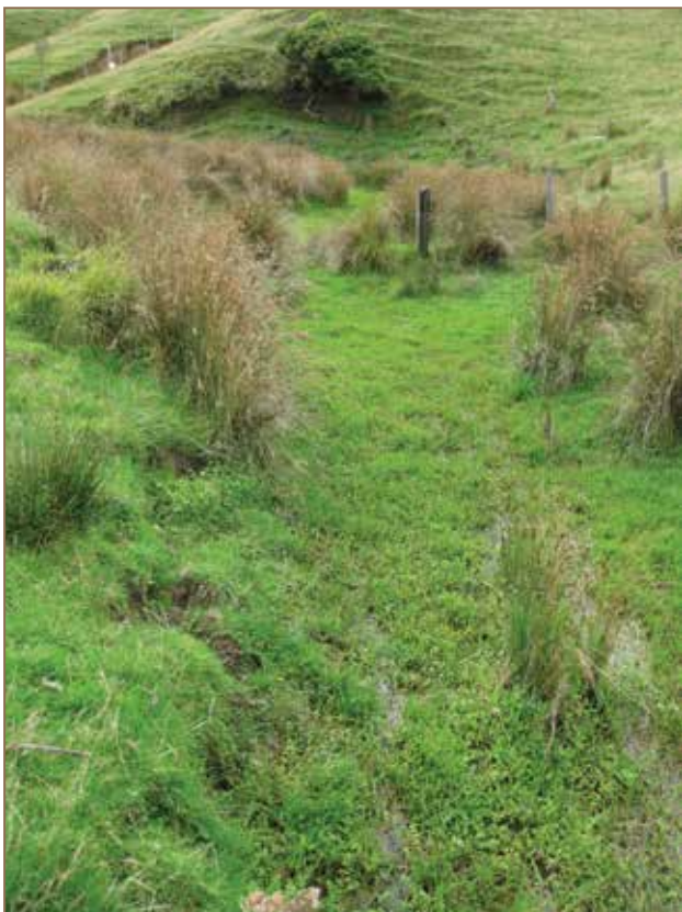
Seepage colonised by pasture grasses. Battle Hill Farm Park, Wellington.

Other wetland types include seepages and geothermal. Seepages occur on slopes with an active steady flow of groundwater and sometimes surface water. They are typically small, localised wetlands that feed, drain or occur within other wetland types. Geothermal wetlands are influenced by heated geothermal water or chemistry derived from current or former geothermal activity. They are concentrated in the volcanically active area in the central North Island.