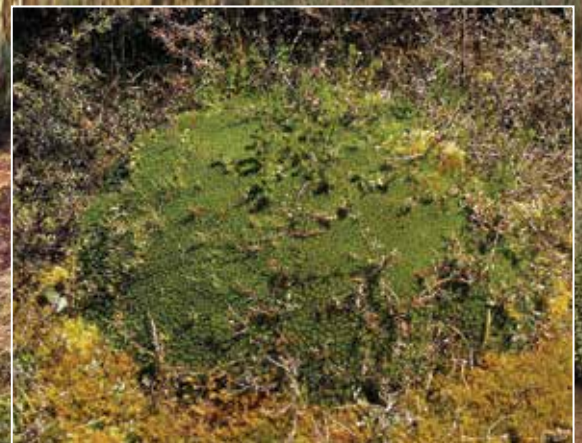
Donatia novae-zelandiae is one of the distinctive cushion forming plants found in the Awarua bog, Southland.