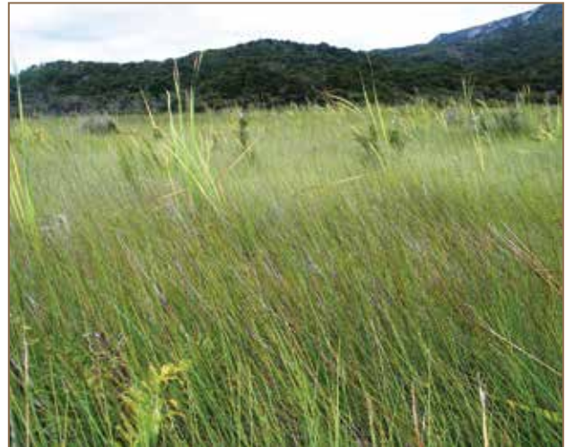
Though called a “swamp”, Kaitoke on Great Barrier Is. is, strictly speaking, a fen.

Scrub, tall herb, tussock grass, fern, restiad and sedge types.