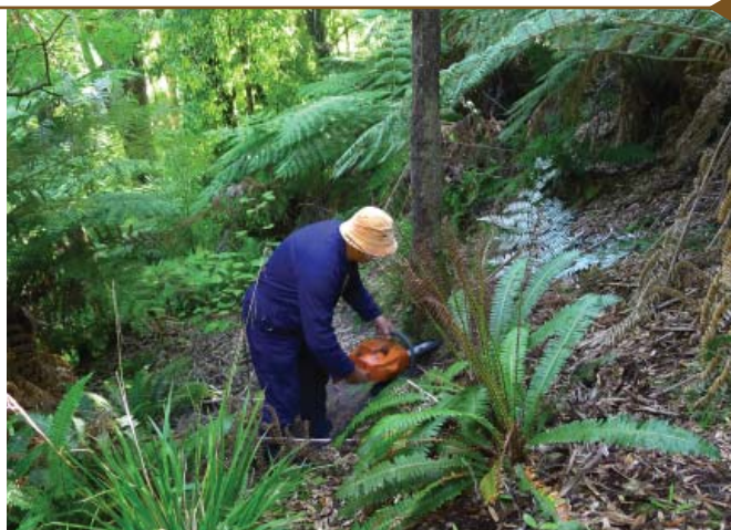
Tahae felling a tall ponga up above Ngapūtahi.

You can age a normal tree by chopping it down and counting the growth rings in the wood. You can't do this with tree ferns because the middle of the stem is filled with pith and there aren't any growth rings. We had the idea of using a technique called radiocarbon dating to age the oldest carbon in the middle of