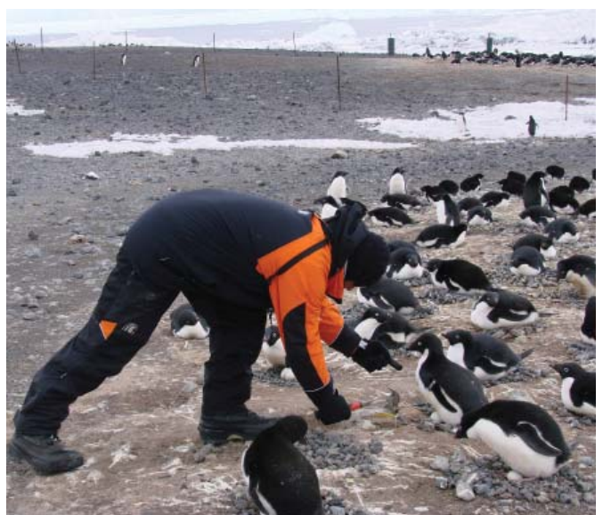
Puke marks a penguin nest, with a parent bird sitting on its eggs. The marked nests in this colony will be monitored throughout the season.