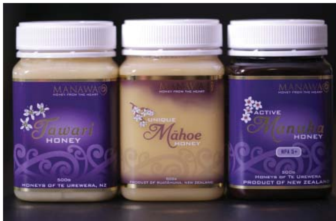
Honeys of Te Urewera range by Manawa Honey NZ – tawari, mahoe and mānuka.

While all honeys are active, mānuka is the only honey that has antibiotic properties based on non-peroxide activity (NPA). While other honey activity will degrade, NPA is stable and lasts over time. Our mānuka honey is an amber honey, with that distinctive medicinal and earthy taste, but it is lighter on the palate than many mānuka honeys.