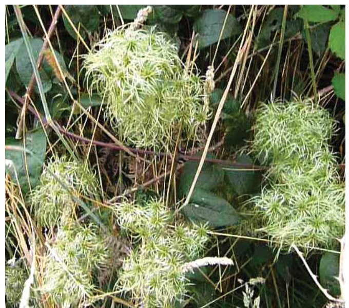
Old Man's Beard has taken hold in some parts of Ruatāhuna but we are working with the Bay of Plenty Regional Council to eradicate it before it spreads widely.

We have worked hard with the Bay of Plenty Regional Council to identify and destroy all Old Man's Beard in our region. The programme is working but is not yet complete, as each season seems to bring up new plants. Our blitz of broom and gorse has also been advanced but still remains a challenge.