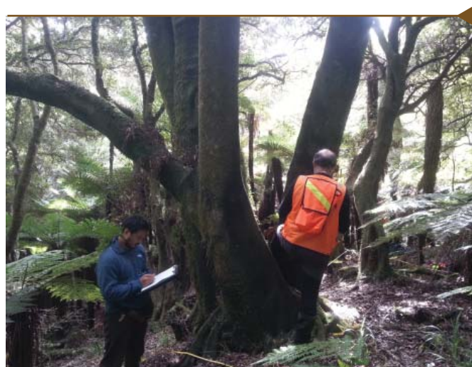
Puke Timoti and Brian Karl measuring a large tawa tree on a sampling plot. These data will be used to calculate indicators of forest health.

Mā te whakarite ka mōhio, Mā te mōhio ka mārāma, Mā te mārāma ka mātau, Mā te mātau ka ora.