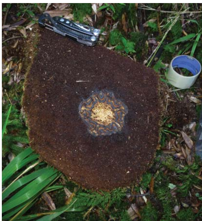
Inside a ponga stem. We collected and aged the hard black material in the middle. Tree ferns don't produce real wood like a tree does, but this hard black material is the nearest thing.

the stem, right at the bottom of the stem. Nobody has ever done this before so we were excited to try it out.