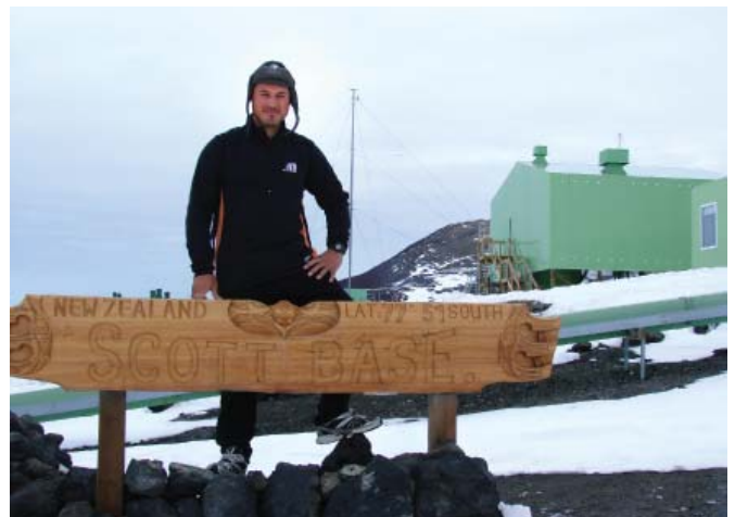
Puke outside New Zealand's Scott Base. The Base provides services and accommodation for the many scientific research parties and groups who visit Antarctica during the summer.