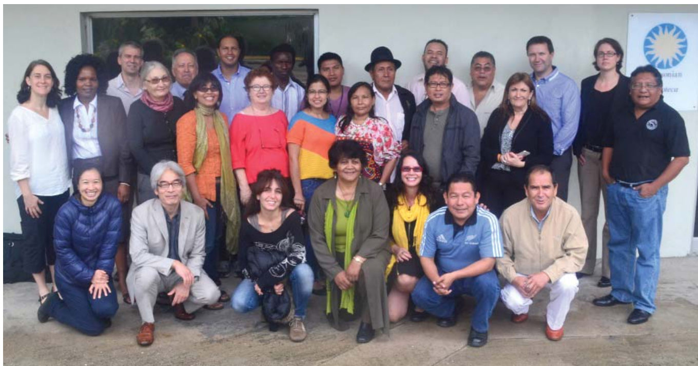
Indigenous and scientific participants at the Global Dialogue Workshop – Indigenous and Local Knowledge of Pollination and Pollinators associated with Food Production, at the Smithsonian Tropical Research Institute, Panama City, Panama.