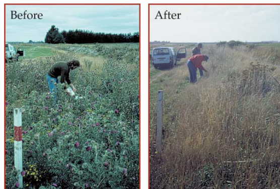
An example of 'before' and 'after' photos. Note the importance of using several permanent landmarks. The shelter belt got chopped down, but the marker post could still be found ensuing reasonable alignment later.

Be aware that it may take many years for changes to infestations (especially for long-lived plants) to become obvious, and that a set of photos taken over a long period is likely to be more convincing than a single 'before' and 'after' shot. Be careful what claims you make about your photos. They are not proof of