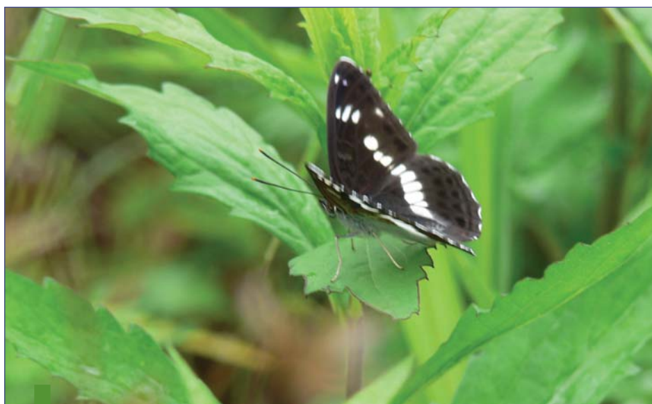
A white admiral butterfly that feeds on Japanese honeysuckle.