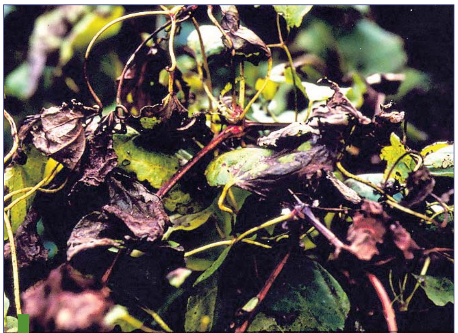
Typical symptoms of Phoma clematidina infection.

This project has highlighted the difficulties we face when trying to track the movements and behaviour of introduced fungal biocontrol agents. However, we have been involved in some research to see if it would be possible to