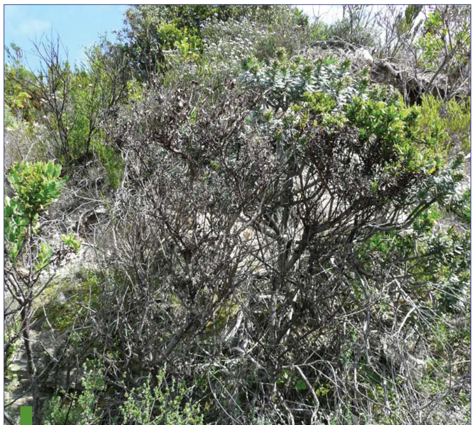
Boneseed plant severely infected by the boneseed rust near Stellenbosch, South Africa.

This project is funded by the National Biocontrol Collective. The Australian project began first so we have been able to benefit from their research and test fewer species.