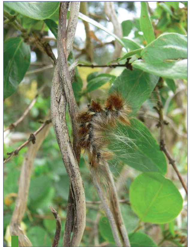
These unusual beasts eat a lot of foliage and are safe to touch.

Amongst the myriad of other creatures found two further species stand out. The larvae of a longhorn beetle ( Oberea mixta ) bore into the woody stems, and were present at many disturbed lowland sites, but were not found in forested and inland sites. Sawfly larvae ( Zaraea lewisii , a Japanese honeysuckle specialist) were also found defoliating the leaves at many sites we visited. So overall the prospects