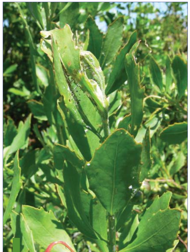
Boneseed leafroller feeding shelter.

tail spines and a protective covering of old moulted skins and excrement. You may also find feeding damage which looks like windows have been made in the leaves.