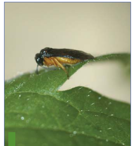
Old man's beard sawfly adult.

( Phytomyza vitalbae ) seems hampered by parasites. Hopes are currently pinned on trials underway in the UK to see if a beetle ( Xylocleptes bispinus ) might be suitable to release. It may also be worth having another crack at establishing the sawfly. A third possibility is to use the old man's beard fungus in a different way. If the superior strain is not able to persist at high levels or in the long term as the result of a single release, then it might be feasible to repeatedly mass-produce and apply it in bulk as often as needed in order to provide control.