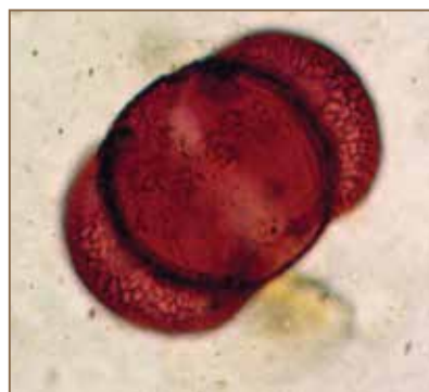
Pine pollen. Both the pine (introduced) and kahikatea (native) pollen samples are stained with carbol fuchsin dye.

Data interpretation requires statistical analyses and an understanding of radiochemistry.