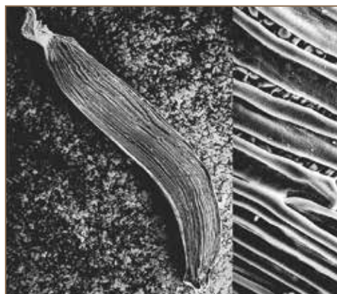
Manuka seed enlarged x30 and x300.

ACKNOWLEDGMENTS: The following organisations kindly contributed information and current (2010) costings to this chapter: The Cawthron Institute, Hill Labs, the Waikato Radiocarbon Dating Laboratory, the National Radiation Laboratory, the Rafter Radiocarbon Dating Laboratory, the Geography Department University of Otago and the Zoology Department University of Otago.