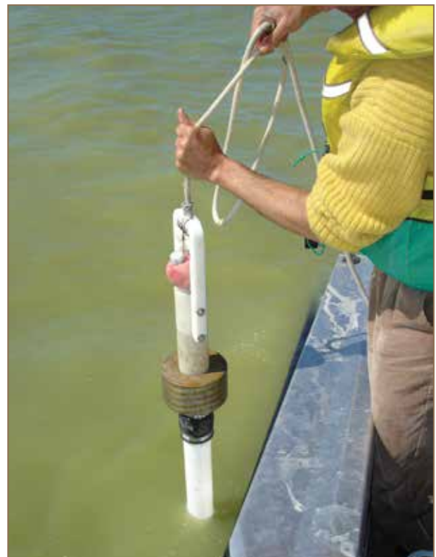
Where water depth is greater than c. 1.5 m, long lengths of plastic pipe can be pushed or driven into the sediment from a boat. Gravity coring in Lake Ellesmere, Canterbury.

After sub-samples of the core have been taken for palaeo-ecological analyses, the core should be archived by wrapping it in plastic and storing it in a cool location, in case further analyses are required. If the core is cut lengthwise, sub-sampling should be conducted on one half of the core while the other half should be archived intact.