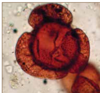
Kahikatea pollen. Studying fossilized pollen can reveal historical vegetation patterns, and imply changes in land use, climate, and disturbance regimes.

Interpretation is relatively straightforward but can be complicated by bioturbation, translocation of ^{137}\text{Cs} rich soil from upstream erosional areas.