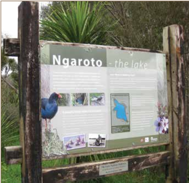
Lake Ngaroto (Waikato) is a recreation reserve administered by Waipa District Council.