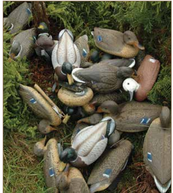
Duck decoys.

One of the many reasons a landowner may choose to protect the wetland through formal means could be to ensure continued hunting opportunities. Lake Serpentine, Waikato.