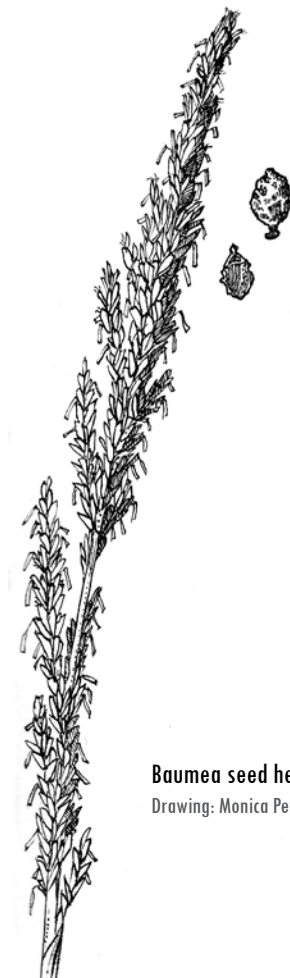
Baumea seed head.