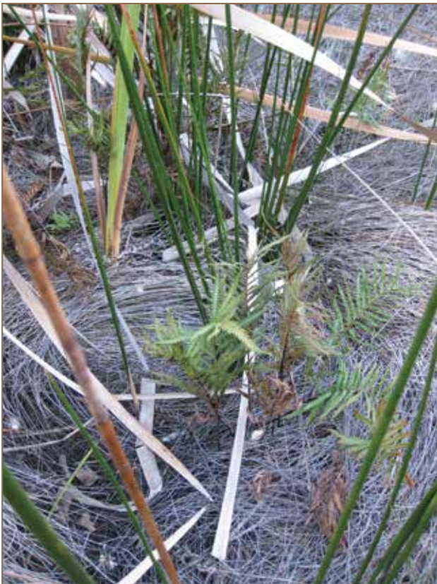
The rare fern, Cyclosorus interruptus. Matakana Island, Bay of Plenty.

Management agreements for conservation purposes are mostly entered into between landowners and a government agency, though in some circumstances they may be developed through other organisations such as the Waiau Fisheries and Wildlife Habitat Enhancement Trust. A significant advantage of management agreements is their flexibility – they can be negotiated to suit the nature of, and any special circumstances associated with, the site. They can also be negotiated around current land uses and landowner needs. The success of a management agreement will ultimately lie in how clearly the rights and obligations of each of the parties in the agreement are laid out, for example, who will be responsible for on-going site maintenance.