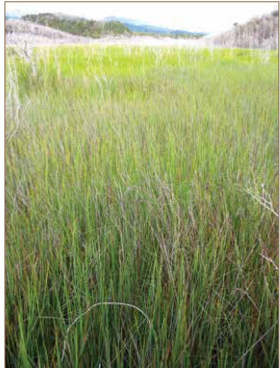
Mangarakau swamp sedge community