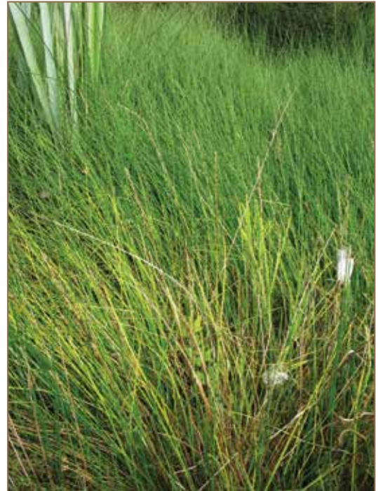
Like raupo, sedges have high nutrient demands. Lake Hakanoa, Waikato.

Point source pollution: farm drains frequently channel dissolved nutrients (nitrogen) and nutrients bound to sediments (phosphorus) directly into wetlands and waterbodies. Waiwhakareke, Waikato.