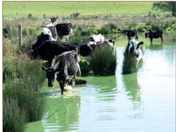
A Waikato wetland much degraded through the impact of agriculture — despite the fencing, the cows are on the wrong side of it!

availability in the wetland and the aquatic habitat. A very common scenario in wetland restoration failure is where people spend a lot of time and money establishing the correct hydrology and planting an attractive, diverse plant community, only to see species like raupo, or exotic weeds, spread explosively and completely dominate the site. Too much nutrient is usually responsible for this.