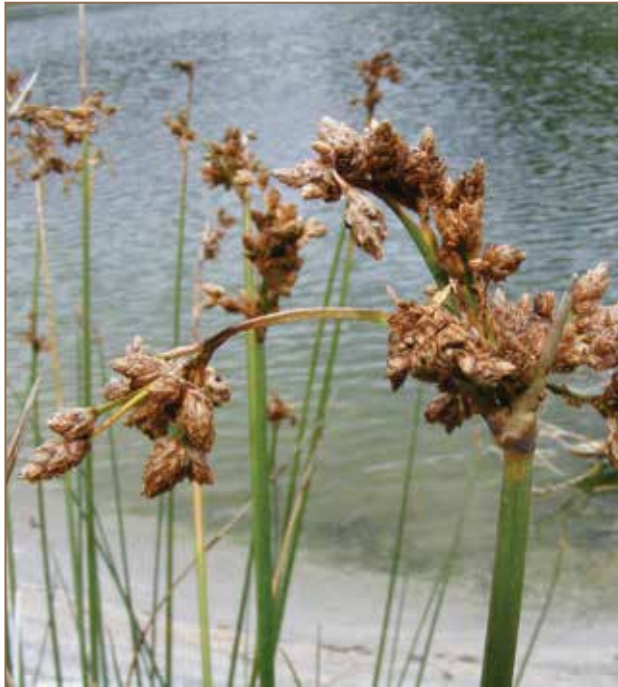
Lake clubrush ( Schoenoplectus tabernaemontani ) is commonly planted in NZ constructed wetlands.