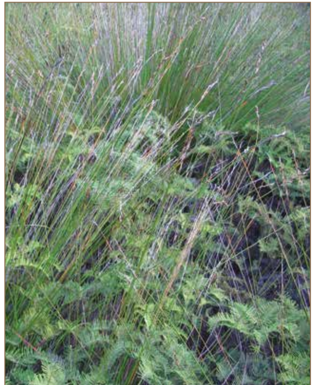
Low nutrient pakihi community, Milnthorpe Park Scenic Reserve, Nelson.