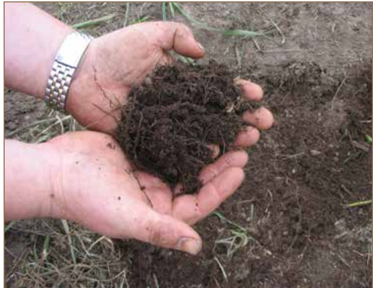
Nutrient rich sediment harvested from a silt trap can be reused away from the restoration site. Lake Kaituna, Waikato.