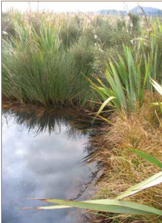
Mangarakau swamp flax community