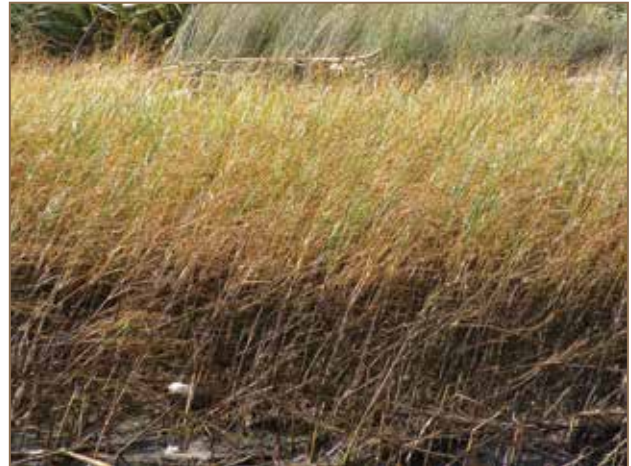
Marsh clubrushes ( Bolboschoenus medianus — pictured, and B. fluviatilis ) are useful species for providing seasonal diversity in treatment wetlands.