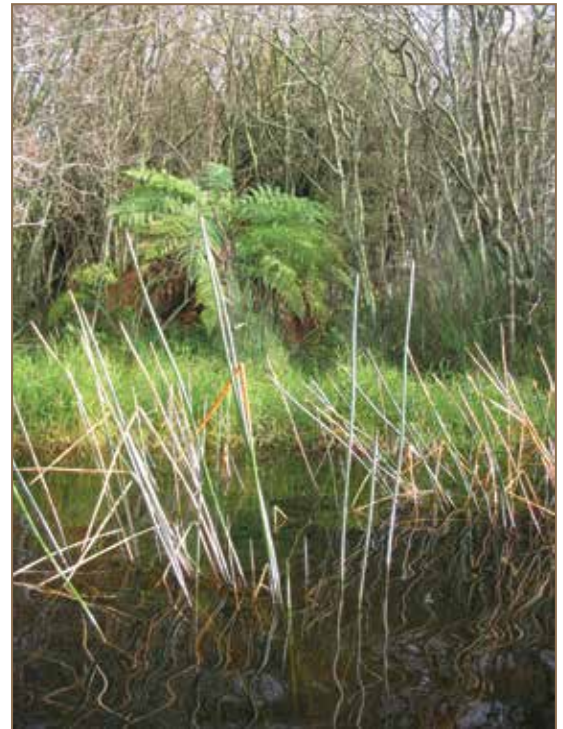
An example of a low nutrient environment: the naturally peat stained waters of Lake Serpentine east, Waikato.

The Howarth Memorial Reserve lies at the edge of the extensively farmed Hauraki Plains creating challenges for effectively managing nutrients entering the wetland from both the river and farm drainage networks