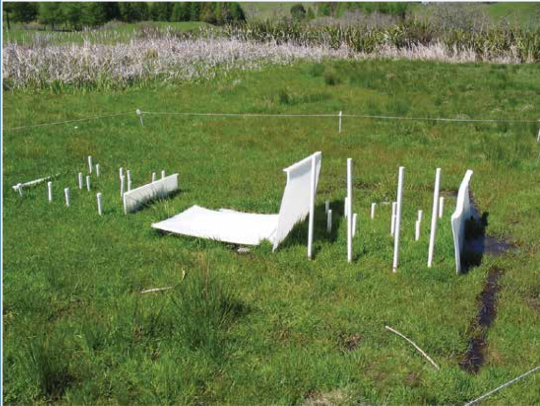
Experimental set up with piezometers