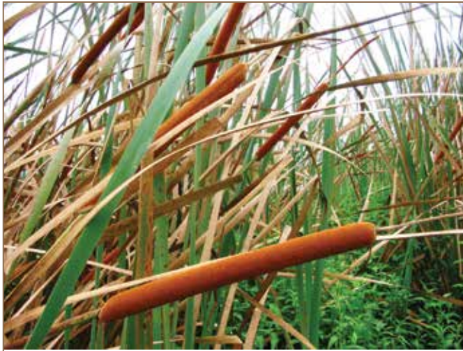
At Lake Kaituna (Waikato) raupo, an indicator of high nutrient levels is periodically removed to ensure it doesn't colonise too much of the shallow lake bed.