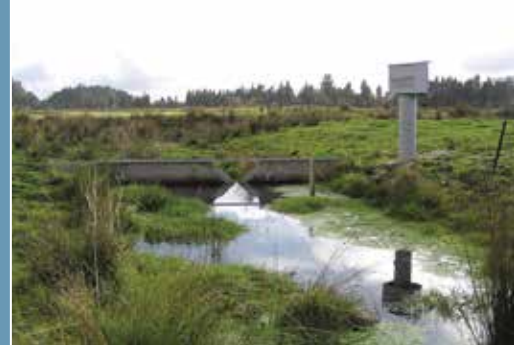
Hollow on farm in Lake Brunner catchment.