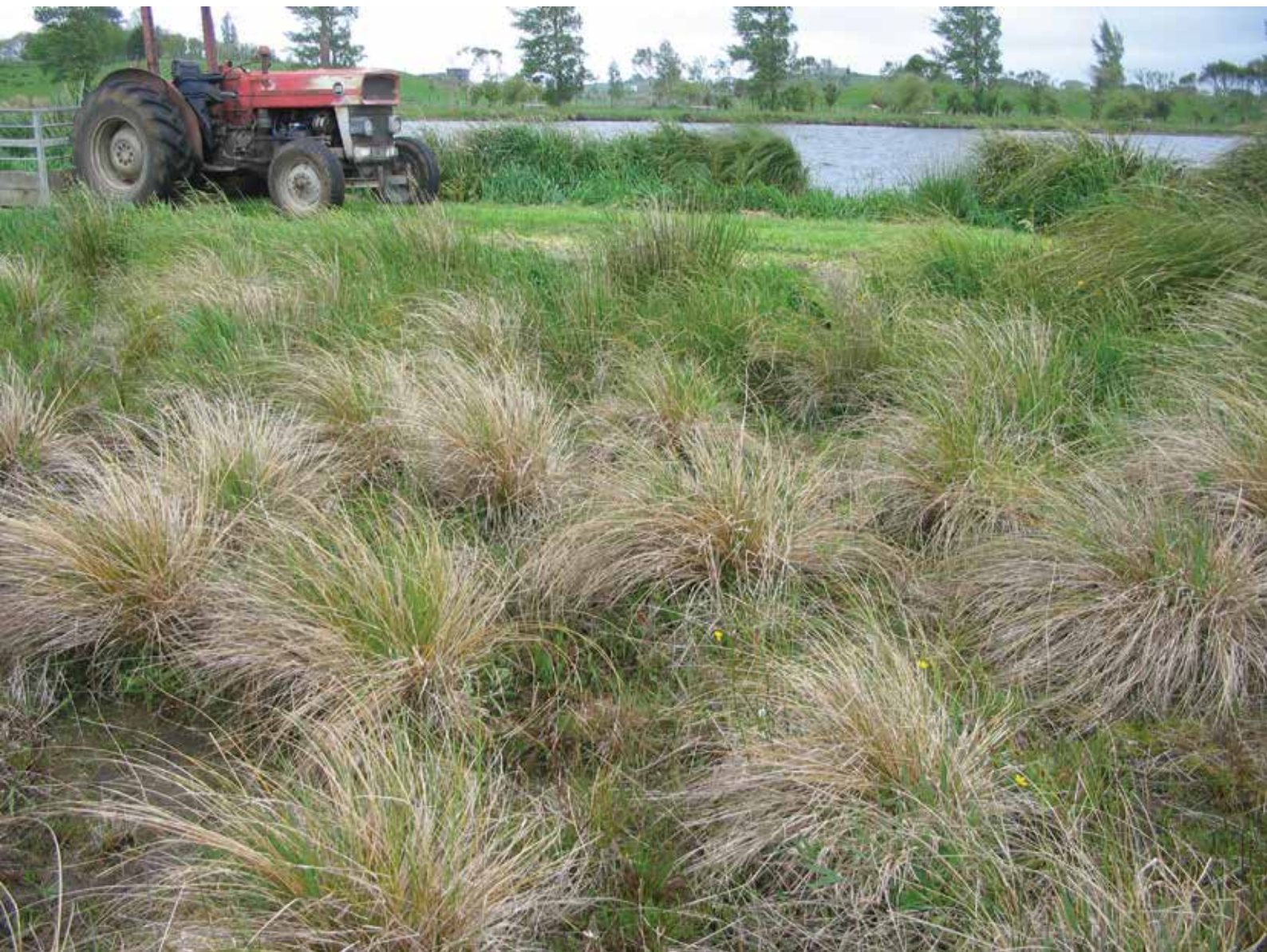
At Lake Kainui (Waikato) a shallow vegetated excavation at the end of a drain enables some nutrient removal prior to water entering the lake