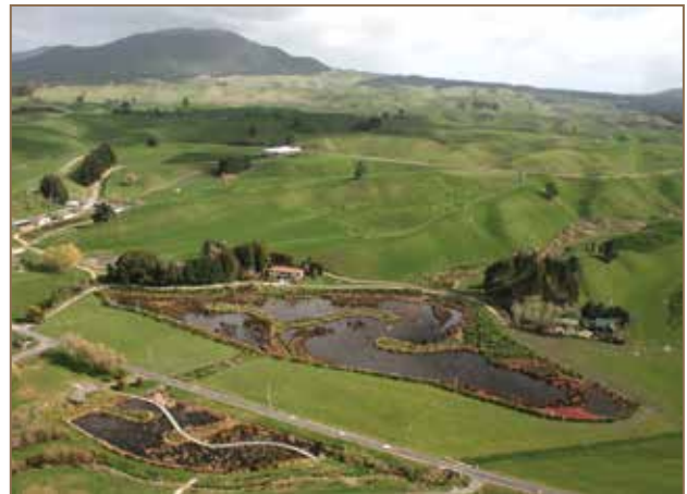
Once mature, the Lake Okaro wetland is predicted to be able to remove around 40–50% of the total nitrogen intercepted. This will complement nutrient reduction from riparian restoration and improved farming practices as well as provide wildlife habitat, enhance biodiversity, landscape and public amenity values.