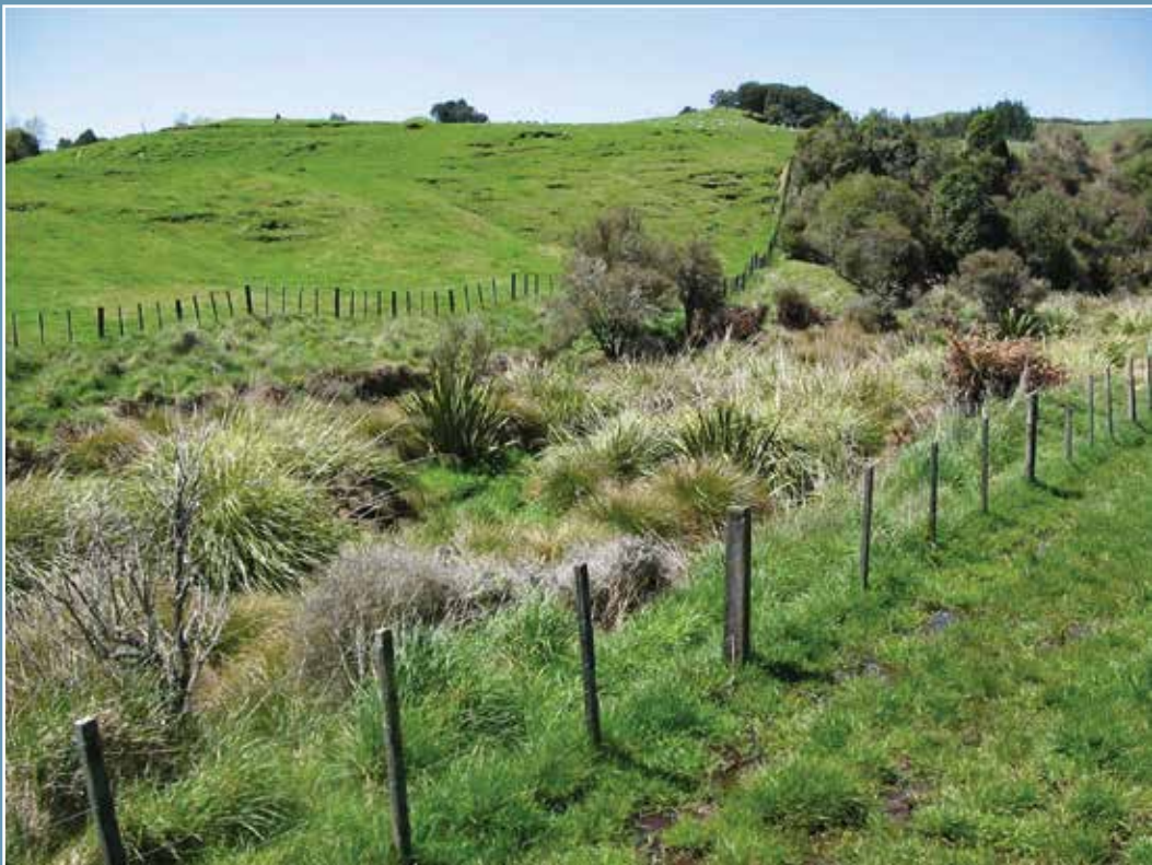
Well-fenced riparian area protecting the wetland values.