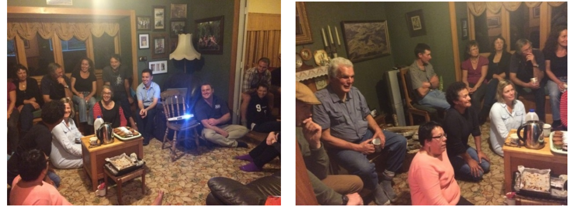
Toreparu Wetland Restoration Group, community meeting, August 2016.

Toreparu Wetland restoration: In August 2016, a Toreparu Wetland Restoration Group community meeting was held to discuss future plans and funding opportunities for wetland restoration. There were 22 attendees, including landowners, iwi representatives, Landcare Research, DOC, Waikato Regional Council, and a contractor who provided options and budget for willow removal. The evening was very productive, and options for willow control were discussed at length. This led to the WRC leading a Freshwater Improvement Fund (MfE) proposal. Landcare Research supported this process as it was seen as an excellent case study site for the LCR Resilient Wetlands work with iwi. Unfortunately, the proposal was unsuccessful in the Freshwater Improvement Fund process and will continue to seek other funding opportunities.