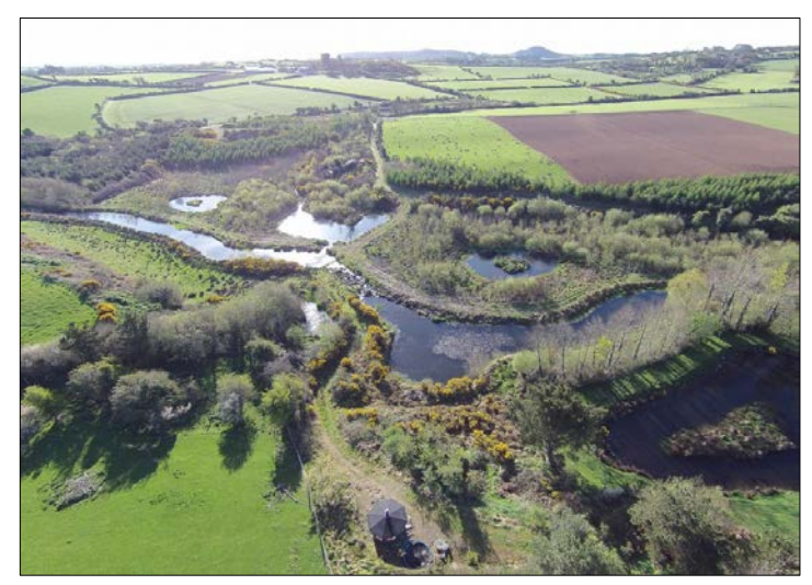
An extensive Integrated Constructed Wetland system, Dunhill, Ireland.

Mitigation wetlands: Bev Clarkson was invited to Ireland in August 2015 by Dr Rory Harrington, VESI Environmental for a 5-day field symposium on Integrated Constructed Wetlands (ICWs) to scope application for NZ environments. ICWs consist of a series of 4–5 shallow free-surface-flow constructed wetland cells containing emergent vegetation. They typically have greater land area requirements than conventional surface-flow constructed wetlands, but their larger footprint facilitates a greater range of physical, biological and chemical processes and richer habitat diversity. These 'reanimated' wetlands clean up waterways and provide multiple ecosystem service benefits (biodiversity, recreational, aesthetic, and economic). Dr Harrington pioneered the ICW approach, which has widespread uptake in United Kingdom and Europe. We organised a reciprocal visit to NZ (February 2016) to assess ICW application to Waikato catchments, and Dr Harrington presented an all-day workshop for multi-stakeholders. Workshop presentations are available on our wetland programme website: ICW workshop part 1,2 & 3. We are currently looking for a Waikato site where we can establish an ICW for research and wider educational (university and general public) purposes.