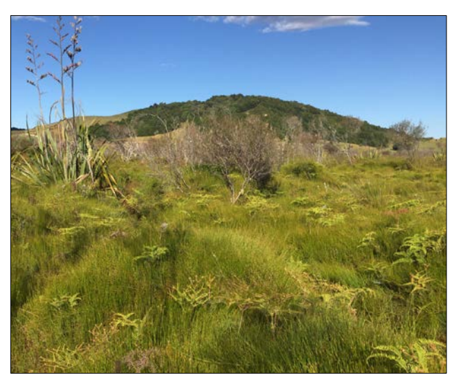
Dense cover of wire rush ( Empodisma robustum ) and tangle fern ( Gleichenia dicarpa ), Otakairangi wetland, Northland.

Otakairangi peatland ecohydrological restoration: Dave Campbell completed a report on the ecohydrology and restoration potential of Otakairangi peat wetland in Northland, a focus of the DOC/Fonterra Living water initiative. Along with surveys carried out by Bev Clarkson and Scott Bartlam, it was discovered that there has been substantial recovery of natural indigenous peatland vegetation, following over 100 years of drainage, fire, and peat degradation.