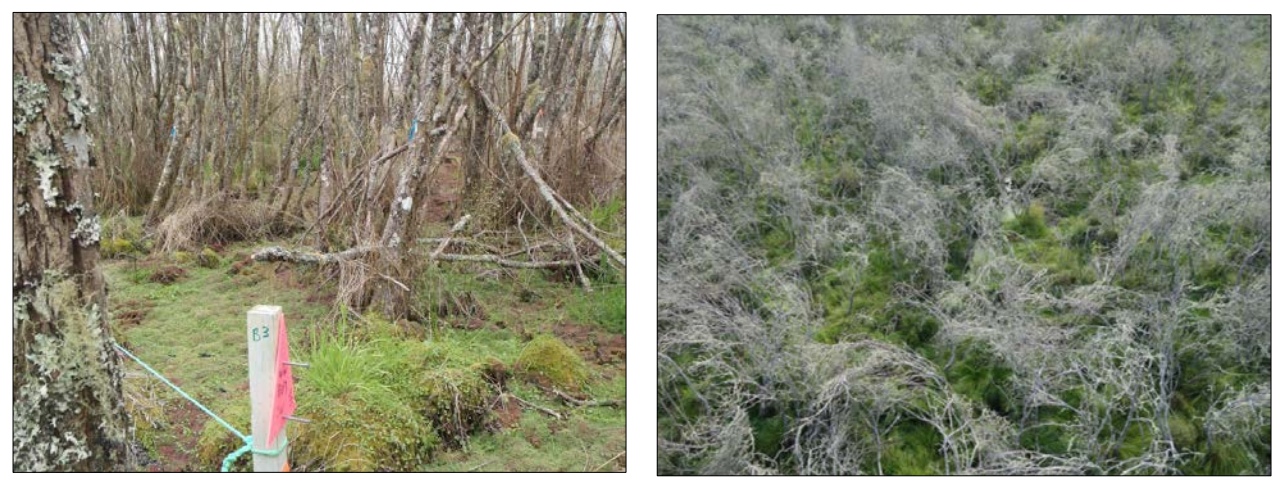
Whangamarino Wetland monitoring after 2012 willow control, L: 2013 (B Clarkson), R: 2015 (K Bodmin).

Glyphosate herbicide not directly toxic to invertebrates: Experiments on responses of invertebrates to glyphosate control of grey willow at Whangamarino Wetland (aligned with the vegetation restoration experiment above) showed no direct short-term (0–7 days post-spray) impacts on terrestrial invertebrates (Watts et al. 2016). Instead, after 30 days, significant decreases in invertebrate richness and abundance were recorded in sprayed plots compared with control plots. Decreases were associated with the loss of willow canopy caused rather by leaf fall and death of the willow trees, which occurred 7 days after spraying, than from direct toxic effects of the herbicide. Subsequent monitoring showed invertebrate numbers increased over the next two years, which was associated with an initial influx of introduced annuals, and then recovery of native vegetation, particularly sedges (Watts et al. 2015). Similarly, aquatic invertebrates were not directly affected by glyphosate spraying. However, in contrast to terrestrial invertebrates, aquatic communities in both the control and spray zones did change over time, but in response to environmental factors, such as drought (Wech et al. 2017). Our work showed restoration via invasive plant control can promote the re-establishment of overall invertebrate communities typical of native wetlands, but long-term sustainability is contingent on prevention of grey willow reinvasion and re-establishment of the native plant habitat.