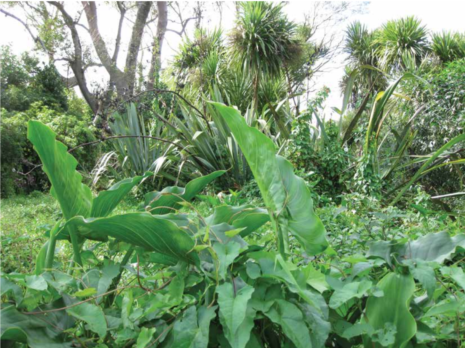
Long lived, arum lilies form dense patches.