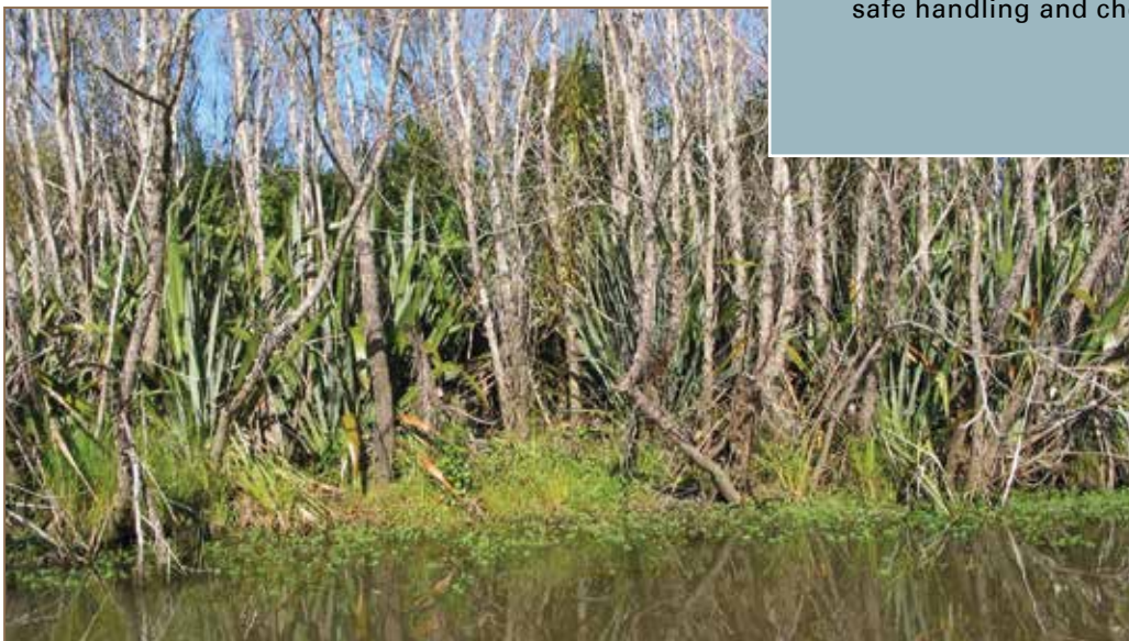
Willows were drilled and injected with herbicide and left as standing deadwood. An understorey of native species has successfully begun to regenerate.

Water levels in modified wetlands are often significantly reduced, contracting the wetland and allowing more terrestrial plant pests such as blackberry, gorse and pampas to take hold. Restoring the amount of water in the wetland, and reinstating the natural seasonal fluctuations, can prevent many weeds from establishing and assist with control of terrestrial species. See Chapter 7 – Hydrology, for further information.