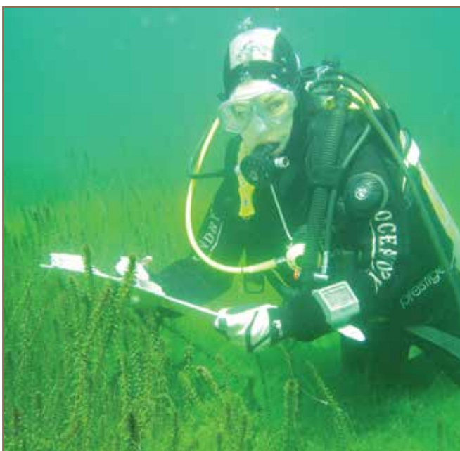
Carrying out Lake SPI monitoring at Lake Waikaremoana, East Coast/Hawke's Bay.

Where a wetland borders a deep water body, the LakeSPI method (see links to useful websites at the end of the chapter) can be used to assess and monitor the ecological condition of the lake through submerged plant indicators (SPI). Divers record information on both native and exotic submerged plants, including species, cover, maximum depth and maximum height, over several transects; usually five transects are recommended. A simple scoring sheet provides a description of the condition of native vegetation (native condition index), the condition of submerged weeds (an invasive condition index), and the overall ecological state of the lake (lake condition index). Any change in these indices can be monitored over time for a particular lake and also compared with other lakes throughout New Zealand.