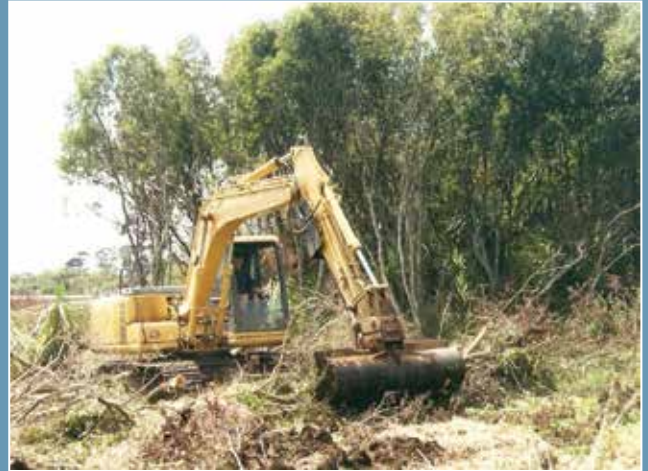
Large-scale restoration takes large-scale approaches: a digger was necessary to remove the dense stands of grey willow.