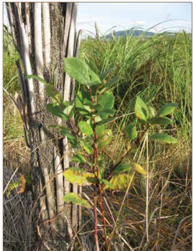
Weed reinvasion remains a constant threat. Grey willow seedling, Hannah's Bay wetland, Rotorua.