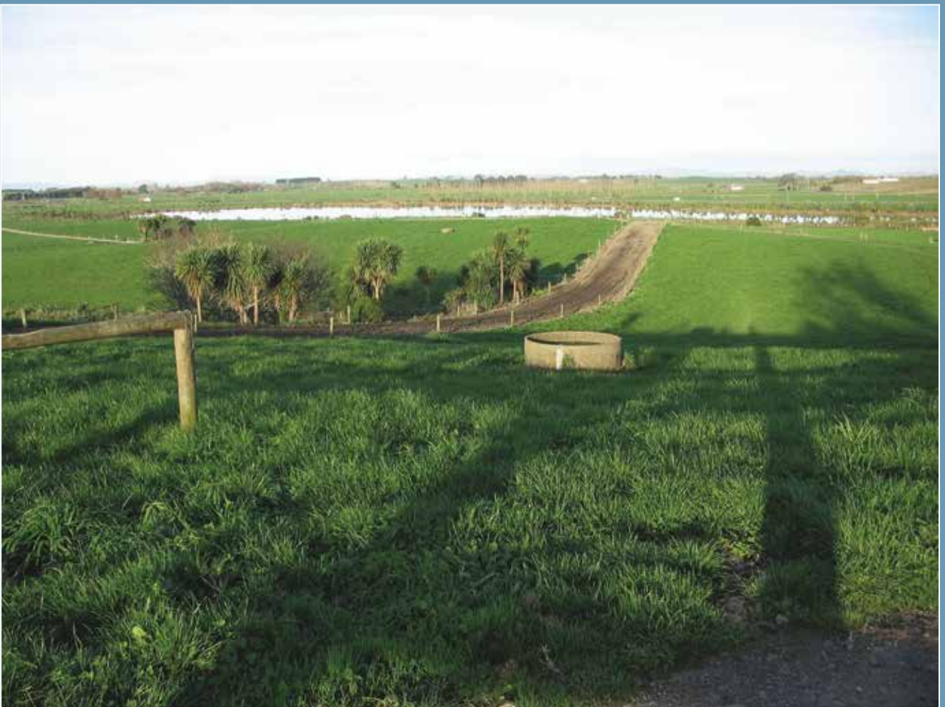
Lake Kaituna as seen from the farm.