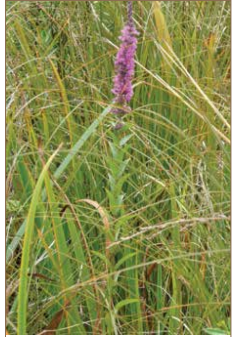
Purple loosestrife produces abundant long-lived, highly viable seeds.