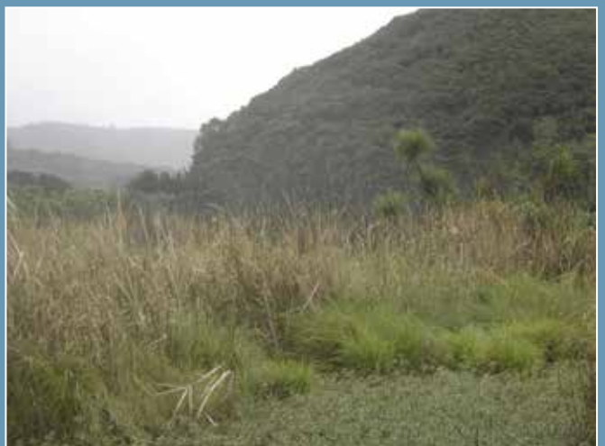
Wetland edge showing emergent native vegetation among controlled willow saplings.