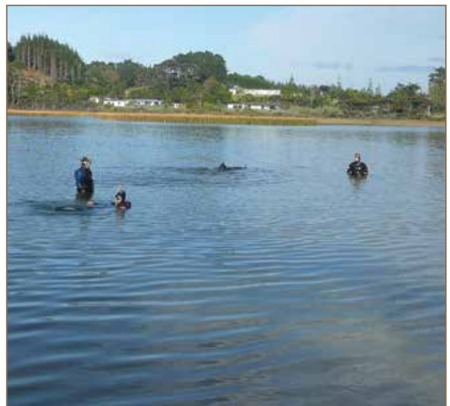
Snorkelling can also be used in shallow water wetlands to gain a better understanding of the species present and the ratio of native aquatic plants to introduced species. Lake Ngatu, Northland.