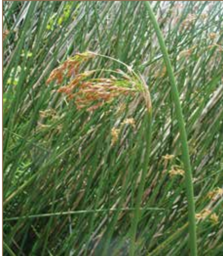
Californian clubrush flowering heads.