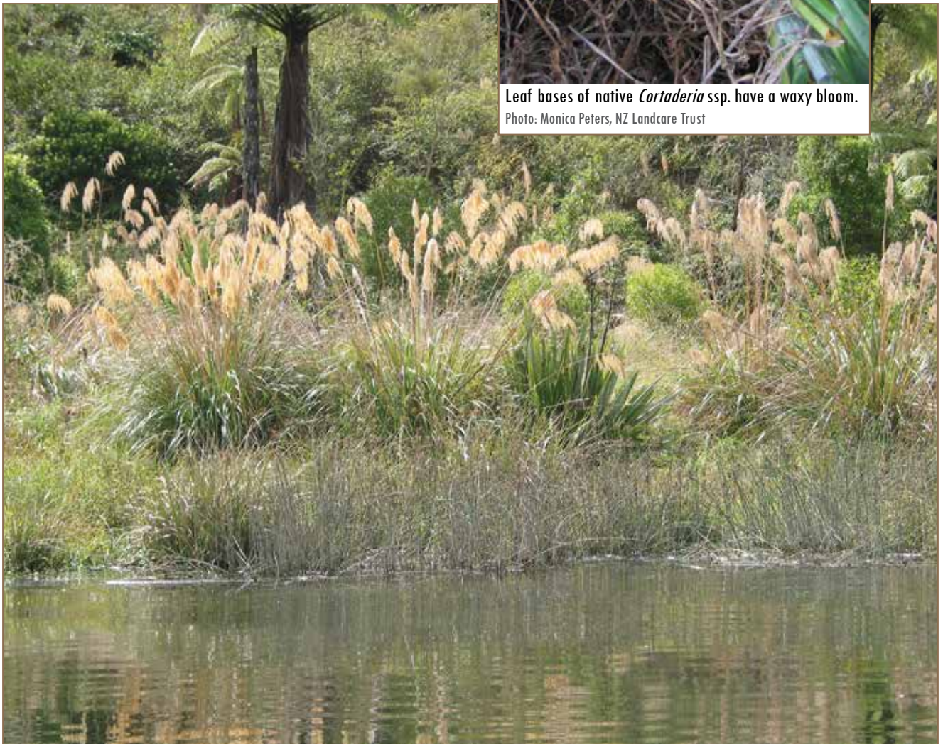
Friend or foe? There are several features that distinguish native Cortaderia species (toetoe, Cortaderia fulvida shown) from their introduced cousins. Native flowering heads are mostly lax, and leaf bases have a distinctive waxy bloom.