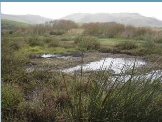
A patch of sprayed alligator weed with willows in the background.