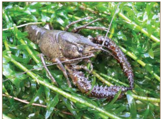
Aquatic habitats are under threat from introduced plants such as egeria ( Egeria densa ), which also negatively affect populations of native fauna such as koura.

You can get some clues on wetland type from what native plant species remain in your wetland, from the soil type (e.g., presence of peat), by visiting similar wetlands in the vicinity, or by researching historical records. A little investigation on the relevant wetland type in your region should also reveal information on the typical or main vegetation communities (including current and potential weeds), habitats, plant and wildlife species, and rare species, which can help focus your restoration project. Historical photographs and/or local knowledge may also reveal useful information about weeds. These sources could help determine whether weeds are spreading and if so, how quickly, or whether weeds have remained in discrete areas. Further information on finding and using reference wetlands can be found in Chapter 4 – Site interpretation 1. More in-depth studies to learn about the history of the wetland can be found in Chapter 5 – Site interpretation 2.