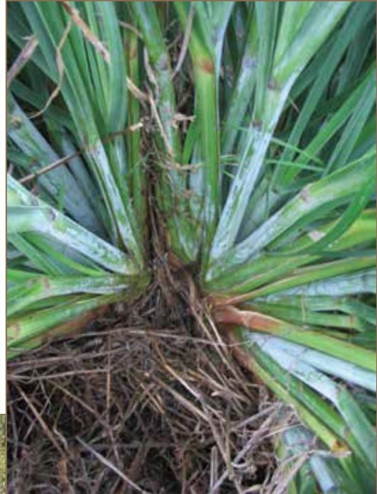
Leaf bases of native Cortaderia spp. have a waxy bloom.