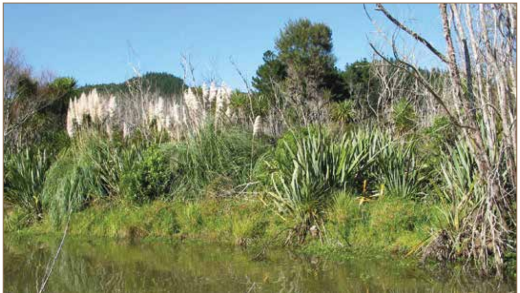
Willows were drilled and injected with herbicide. Large-scale disturbance through mechanical removal has allowed weed invasion.

Try to keep disturbance at a site to a minimum as most weeds thrive on disturbance. It may be that a 'do nothing' approach is required when the collateral damage to non-target (desirable) plants will be too great or when control of a weed could lead to a worse weed invading. Restoration works carried out at Te Henga wetland (Auckland) provides a striking example of two very different