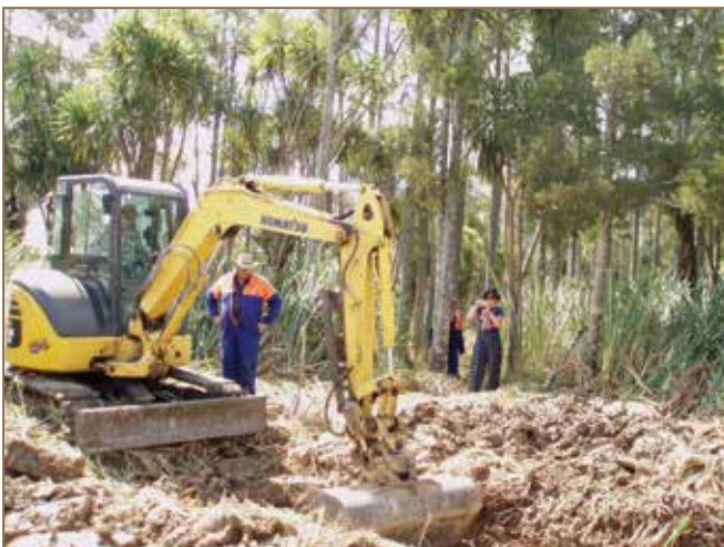
NIWA is monitoring the results of management experiments for highly invasive weeds such as Manchurian wild rice.

Along with weed maintenance, monitoring is an ongoing activity that you need to plan and for which you need to allow time. Chapter 13 – Monitoring includes further methods for monitoring restoration progress. Remember to make the monitoring regular and to keep good records.