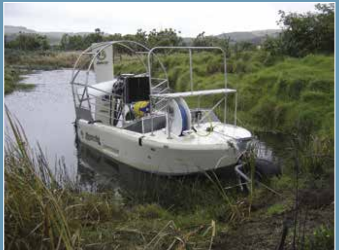
The amphibian boat used for weed control work.