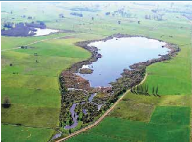
Willows completely cleared from Lake Kaituna and regeneration well underway. The grayish stands of willow on the adjacent lake (Komakorau) have since been removed.