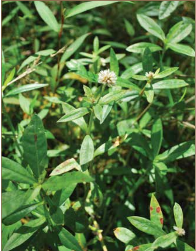
Alligator weed, native to South America, is regarded as one of the world's worst weeds.

Often there will be more weeds than you can tackle at once. Weeds that you have the least of, but which could rapidly invade your wetland, should generally be prioritised above those weeds that are already abundant and have occupied much of their available wetland habitat. Also check the lists of environmental weeds in the useful websites section at the end of the chapter to see what weeds you don't have. Are these weeds nearby? If so, what's the likelihood of their spreading to your wetland?