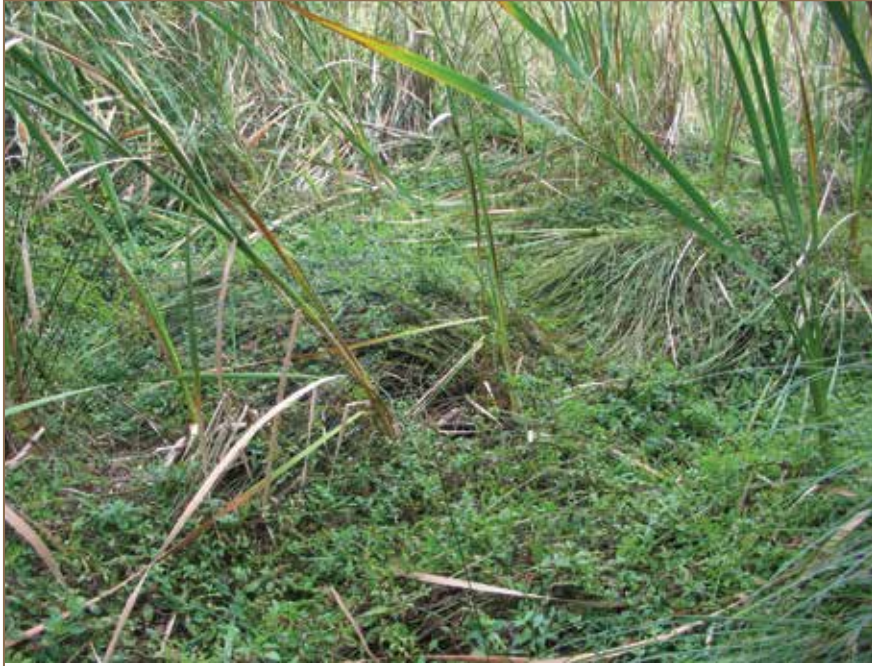
Gypsywort growing among raupo and smothering Carex spp.