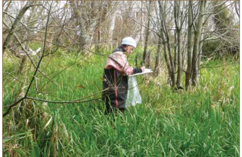
Reed sweet grass forms dense mats on water and in damp areas.