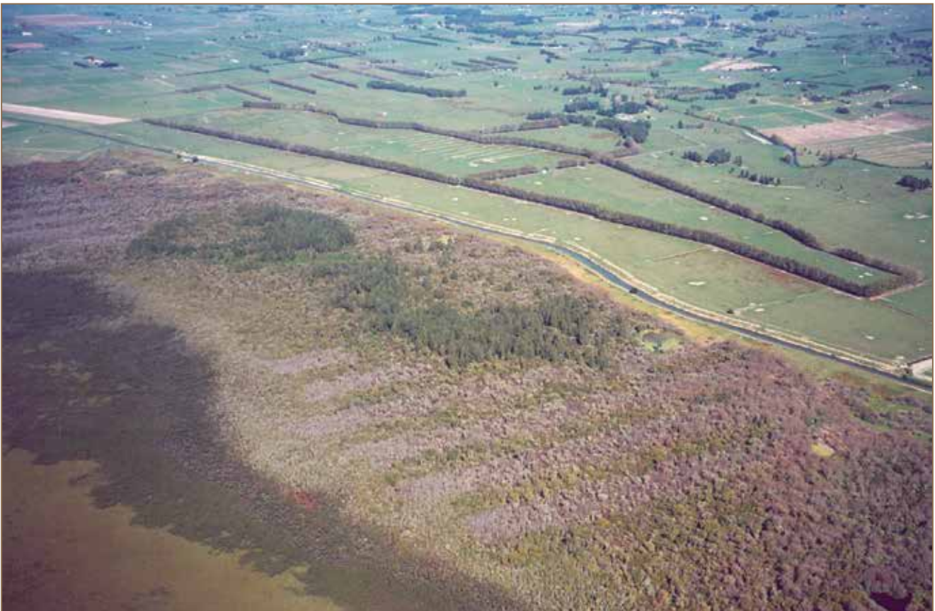
DOC Aerial herbicide willow control trials in 2001 at Kopuatai peat dome, Waikato. Monitoring results show that limited damage occurred to native understory vegetation though seedling and sapling grey willows have re-established. Open areas of willow have been colonised by native sedges, invasive grasses and annual weeds.

For more detailed monitoring information on how to sample vegetation, soil and water parameters, follow the Wetland Condition Handbook methodology and fill in the Handbook plot sheet (see weblink at the end of the chapter). Add any additional monitoring components specific to your wetland.