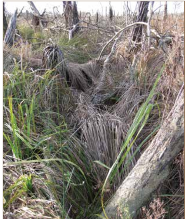
Rewetting Hannah's Bay wetland (Rotorua) has resulted in a change of species from dryland to wetland, aided by weed control and plantings of natives.

Mechanical disturbance coupled with changing the hydrology of the wetland have enabled weeds including grey willow, gorse and royal fern to establish. Kopuatai peat dome, Waikato.