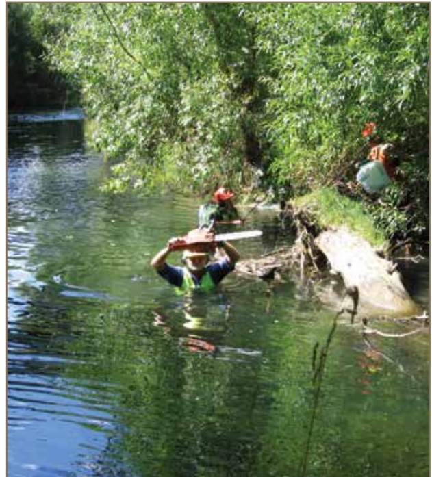
Controlling weed infestations in wetlands is without a doubt challenging! Good safety gear and a sound knowledge of chemical and tool handling are essential.

Weeds that require light to survive will be less vigorous or die out once a canopy of desirable plants is established. These light-demanding weeds can provide some intermediate benefits, such as soil moisture retention, but need to be kept below planted natives to prevent the native plants from being out competed and smothered. Other pest plants, such as Chinese privet and royal fern, tolerate shade and will require ongoing maintenance. Timing of follow-up control work needs to be scheduled regularly, usually every 2–3 months, or more regularly in good growing conditions. Any follow-up work needs to take account of other activities on which it may impact, especially planting.