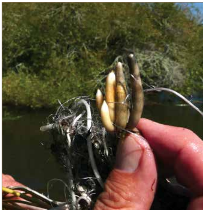
The banana shaped tubers are a key diagnostic feature of the Mexican waterlily — useful when no flowers are present.