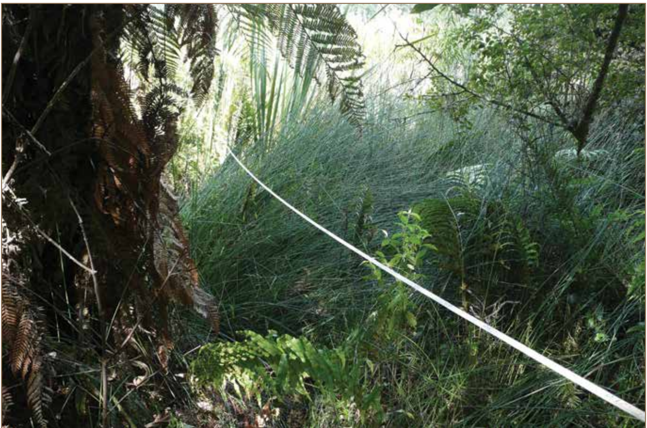
Vegetation transect line. Whakamaru, Waikato.

Monitor immediately before restoration starts and at intervals afterwards (yearly if rapid change is expected, less frequently for minor change). Add any additional monitoring components specific to your wetland.