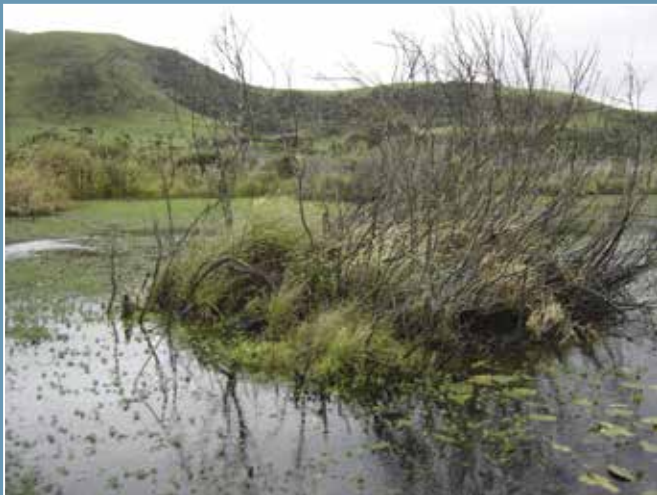
An island of willows that has been controlled.