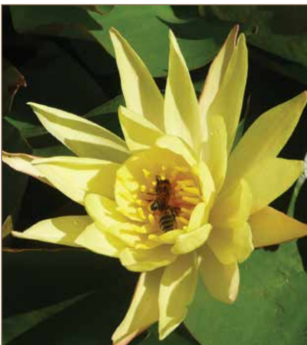
Attractive flowers are one reason the Mexican waterlily was introduced.