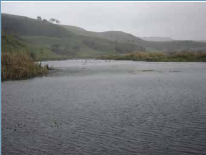
General view of the wetland central water body, looking upstream.