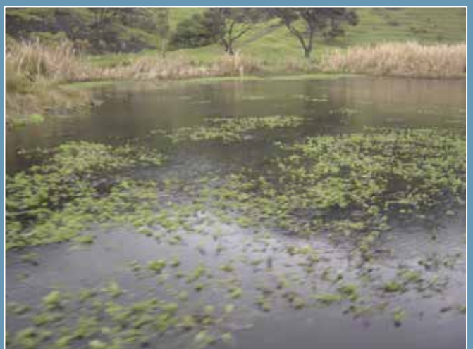
A stretch of water once was covered in Mexican waterlily. Parrot's feather now unfortunately dominates.