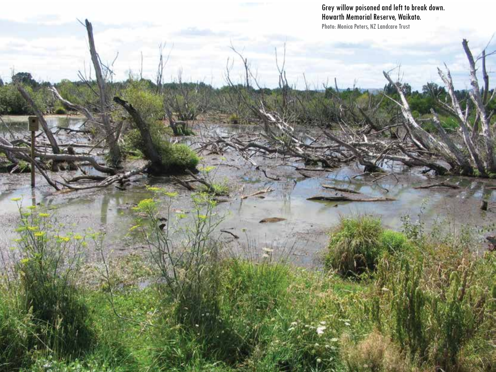
Grey willow poisoned and left to break down. Howarth Memorial Reserve, Waikato.