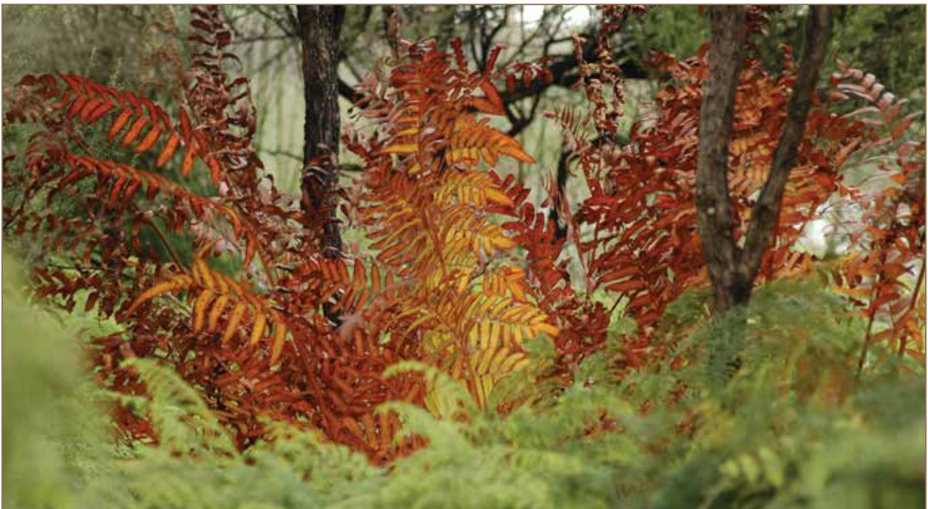
Royal fern displaying autumnal colours.

* Note that common names can vary widely