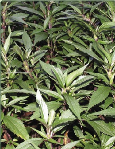
Galls near growing tips

Mist Flower Gall Fly ( Procecidochares alani )