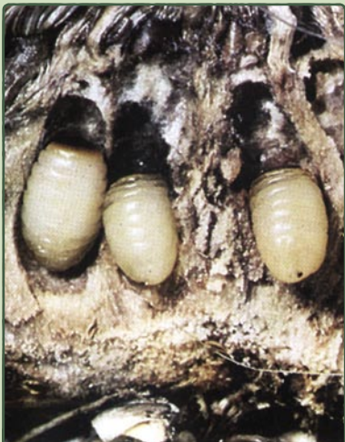
Infested flowerhead cut open to expose larvae

Agent: Scotch Thistle Gall Fly ( Urophora stylata )