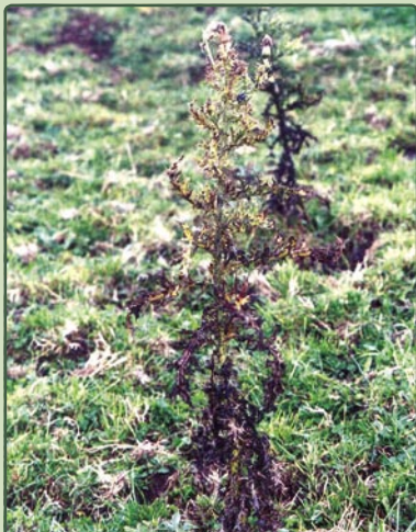
Phoma leaf blight

Agent: White Soft Rot ( Sclerotinia sclerotiorum ), Phoma Leaf Blight ( Phoma exigua var. exigua ), Californian Thistle Rust ( Puccinia punctiformis )