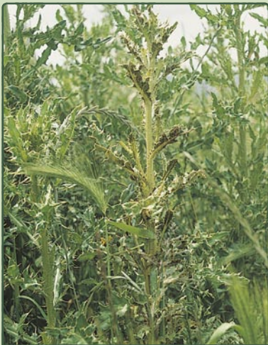
Californian thistle rust