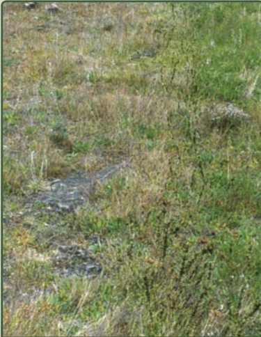
Feeding front advancing to right

Lesser St John's Wort Beetle ( Chrysolina hyperici ), Greater St John's Wort Beetle ( Chrysolina quadrigemina )