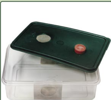
An ideal container