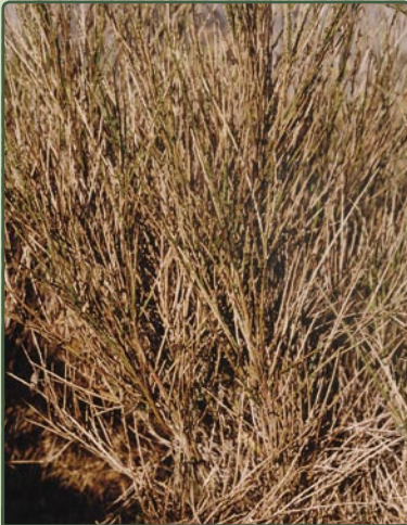
Heavily mined broom

Broom Twig Miner ( Leucoptera spartifoliella )