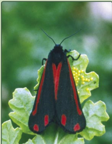
Adult moth and eggs

Agent: Cinnabar Moth ( Tyria jacobaeae )