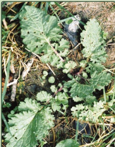
Adult feeding damage

Agent: Ragwort Flea Beetle ( Longitarsus jacobaeae )