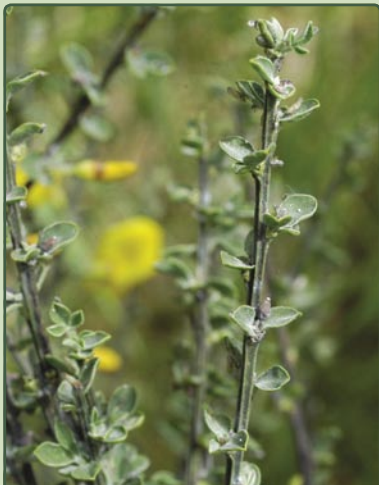
Blackened stems and damage to new growth buds

Agent: Broom Psyllid ( Arytainilla spartiophila )