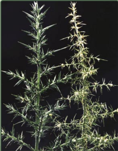
Healthy gorse (left) and damaged gorse (right)

Gorse Thrips ( Sericothrips staphylinus )