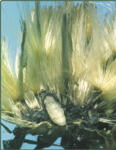
Infested flowerhead cut open to expose pupa

Agent: Nodding Thistle Receptacle Weevil ( Rhinocyllus conicus )