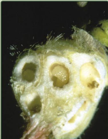
Larvae inside multi-chambered gall

Hieracium Gall Wasp ( Aulacidea subterminalis )