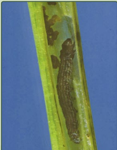
Caterpillar inside stem