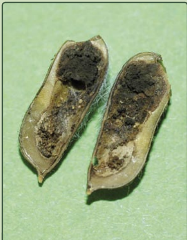
Damaged pod with frass

Agent: Gorse Pod Moth ( Cydia ulicetana )