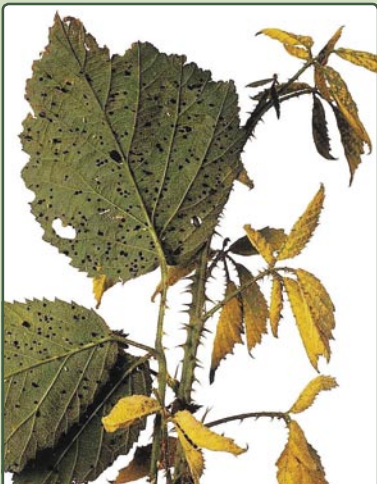
Black winter and yellow summer spores

Blackberry Rust ( Phragmidium violaceum )