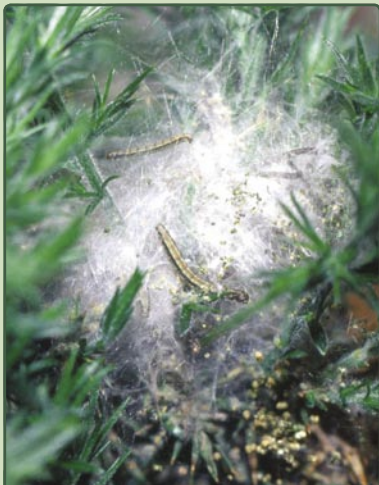
Caterpillars inside web

Agent: Gorse Colonial Hard Shoot Moth ( Pempelia genistella )