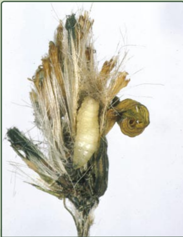
Larva in flowerhead

Agent: Ragwort Seedfly ( Botanophila jacobaeae )