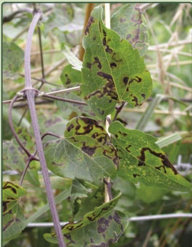
Mines and feeding punctures

Agent: Old Man's Beard Leaf Miner ( Phytomyza vitalbae )