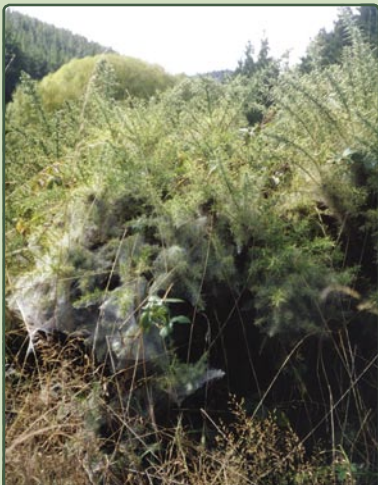
Heavily attacked bush with webbing and bleached foliage

Agent: Gorse Spider Mite ( Tetranychus lintearius )