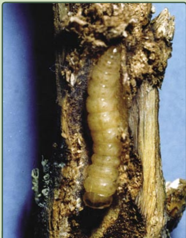
Gorse stem miner caterpillar

Agent: Gorse Stem Miner ( Anisoplaça pyoptera ), Lemon Tree Borer ( Oemona hirta )