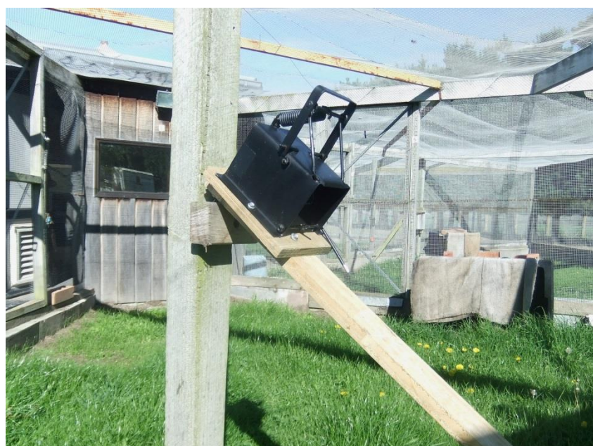
Figure 1 SA2 Kat kill trap set at the top of a leaning board. Trap shown unset.

Cats were acclimatised to captivity in outdoor pens for at least 2 weeks before being transferred to observation pens for the trap testing. Cats were penned individually and the trap was tested in a free-approach test. In each observation pen a trap was set at the top of a leaning board c. 1 m above the ground (Fig. 1). The trap was baited with chicken mince on the floor of the trap, and two small smears of mince were placed on the leaning board to encourage cats to walk up the board towards the trap. Once set, the base of the trap trigger was 90 mm in from the mouth of the trap.