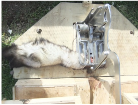
0.84 kg male