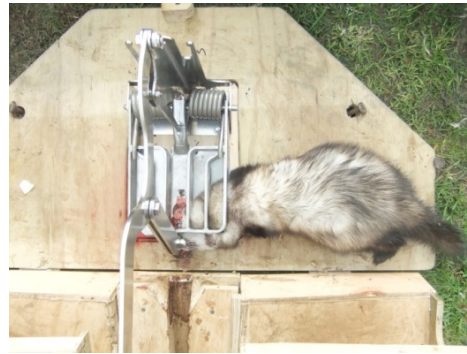
0.91 kg female