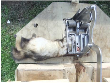
0.94 kg female