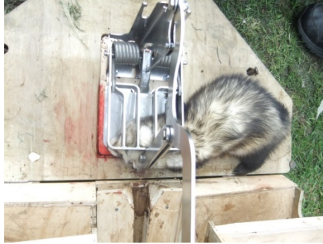
1.59 kg male