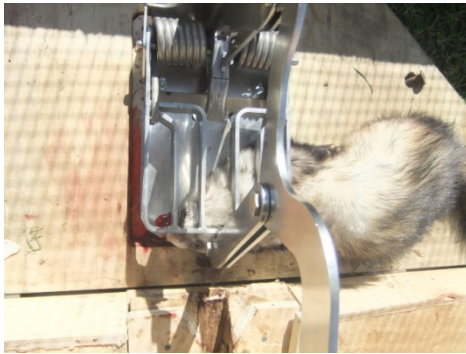
1.00 kg female