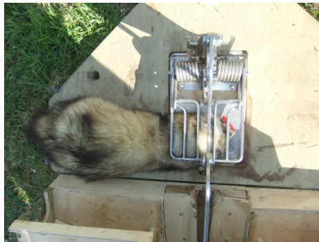
1.78 kg male