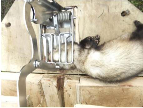
1.76 kg male