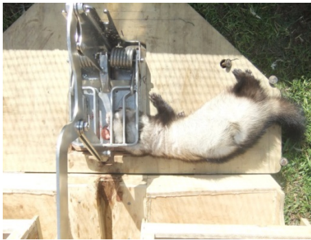
0.94 kg female