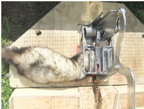
0.99 kg female