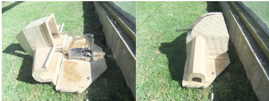
Figure 1 pT1000 kill trap in double-ended tunnel. L: Tunnel opened to show trap. R: Tunnel closed. Six rebar rods were used to pin down the trap tunnel base. Trap and tunnel shown is the final configuration, which is unset in both photos. The trap was firmly bolted to the tunnel base.

The client provided pT1000 kill traps to test their killing performance on ferrets. Wild-caught ferrets were acclimated to captivity in outdoor cages for at least 2 months before being transferred to observation pens for the trap testing. Five captive-bred ferrets older than 6 months were also used. Ferrets were penned individually and trialled in a free-approach test during the day. In each observation pen a trap was set in a double-ended tunnel, which was firmly pinned to the ground using 30-cm-long rebar rods (Figure 1).