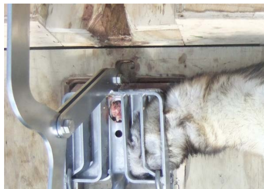
Figure 4 The position of bait used with the podiTRAP™ during test 6 for capturing ferrets. Bait was placed in a trough in the centre front of the trap. The tunnel is shown hinged open.

In earlier tests large males were more likely to survive capture in the trap. Some of the wild-caught ferrets used, or available for the tests, had gained excessive weight during captivity (the largest weighed 2.58 kg) and greatly exceeded the maximum weight reported in the wild (1.88 kg; King 2005). It was considered that these larger specimens were not representative