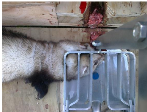
Figure 3 The position of bait used with the podiTRAP™ during tests 4 and 5 for capturing ferrets. Bait was placed in the cavity in front of the trap plate. The tunnel is shown hinged open. Note the blue vanilla-scented lure plug in the centre of the trap plate.