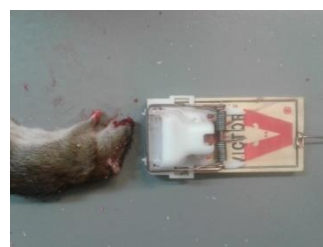
305.8 g male