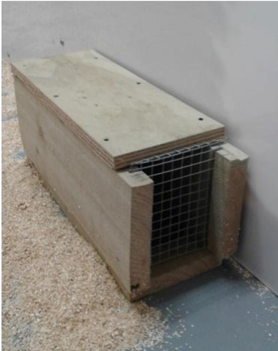
Figure 2. The Predator Free NZ wooden trap tunnel. A 50 × 50 mm entrance hole was cut in the mesh at the far end of the tunnel (not visible) and the mesh at the closed end of the tunnel was removable to allow access to the trap. The Victor® Professional rat trap or Modified Victor stoat and rat trap was set 1–2 cm into the tunnel from the closed end. Two tacks were nailed into the trap tunnel floor in front of the trap to prevent it being pulled forward by a rat or pushed too close to the entrance hole in the front mesh when deployed.

When a rat was struck by the trap, the time to loss of palpebral (blinking) reflex was measured to determine whether the trap had rendered the captured animal irreversibly unconscious within 3 minutes. For the trap to pass the NAWAC trap-testing criterion (2011) as a Class B trap, 10 of 10 rats needed to be rendered irreversibly unconscious within 3 minutes. Once irreversible unconsciousness was identified, a stethoscope was used to determine cessation of heartbeat.