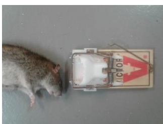
415.1 g male