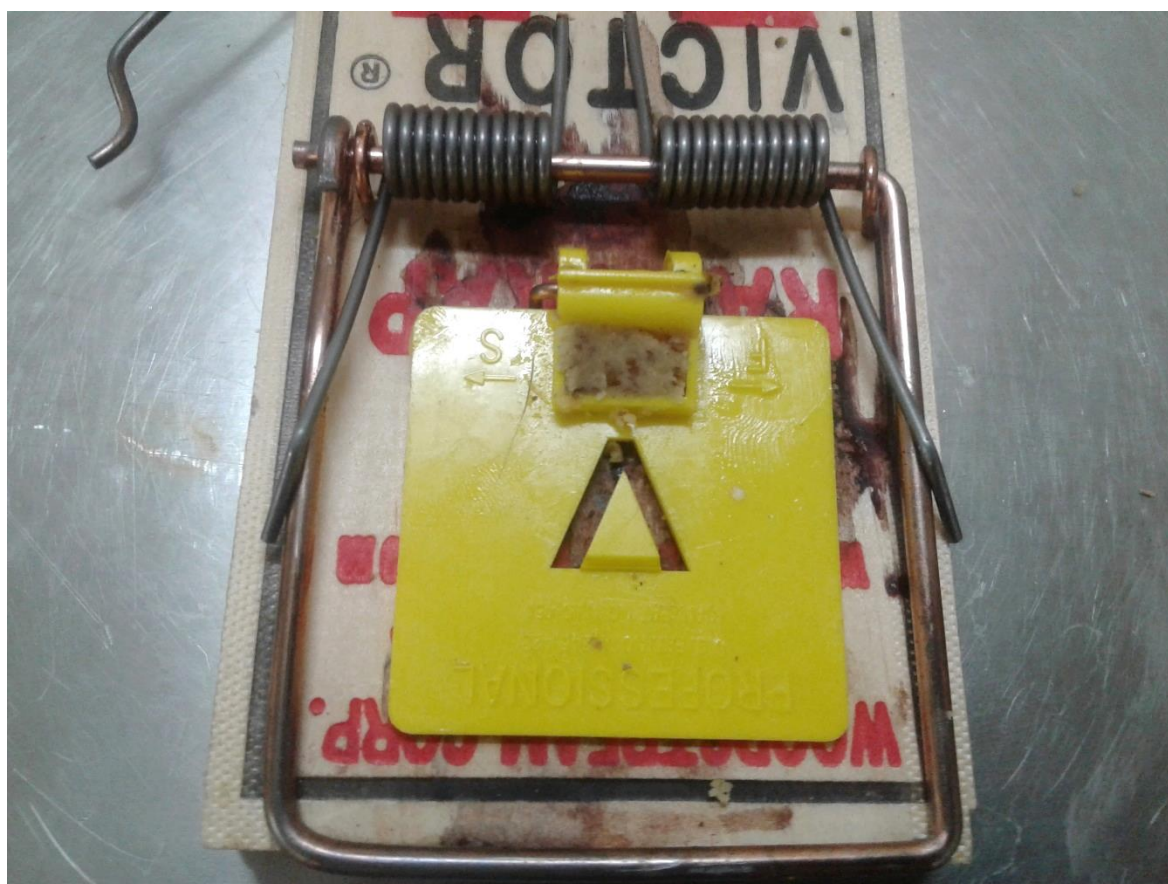
Figure 3. Baited unset Victor® Professional rat trap showing placement of bait in the purpose-made bait-well.

The traps were set in Predator Free NZ wooden tunnels and baited with either walnut paste, Nutella® or smooth peanut butter, applied in the purpose-made bait well near the pivot on the yellow treadle (Figure 3). Once set, the trap was placed in the tunnel so that the back edge of the trap was about 1–2 cm in from the rear mesh, so that there was enough room in front of the trap to allow a rat to fully enter the tunnel. Two tacks were nailed into the trap tunnel floor in front of the trap to prevent it being pulled forward by a rat or pushed too close to the entrance hole in the front mesh when the trap was placed in the tunnel. Testing started on 27 November 2018 and was completed on 9 December 2018.