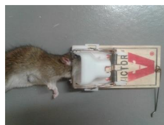
271.8 g male