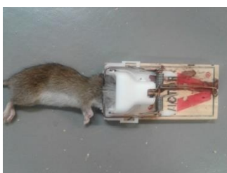
150.9 g female