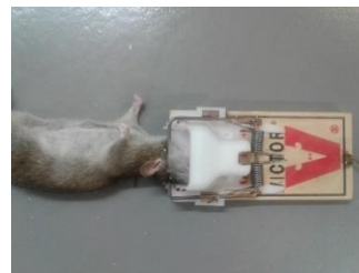
206.4 g female