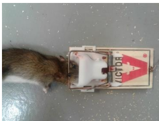
240.3 g male